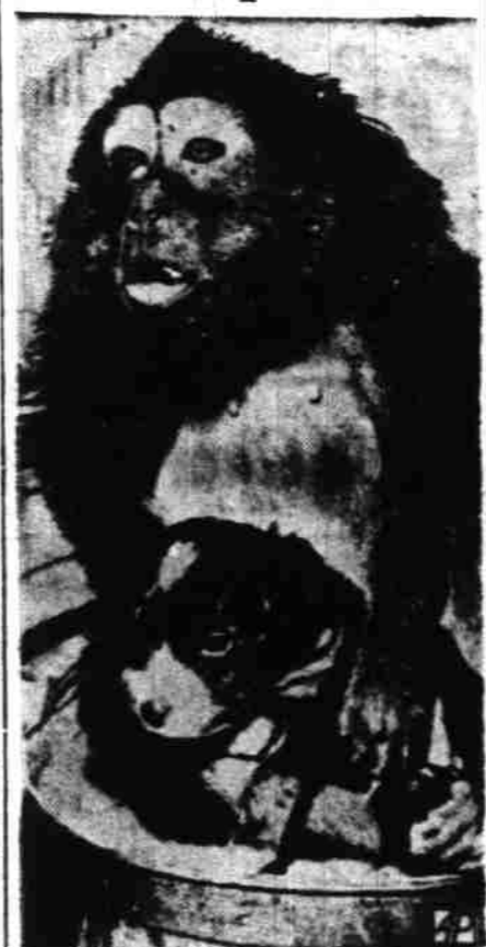
Chico, a Javanese circus monkey, cuddles Butch, a six weeks old puppy she has adopted. Lady, Butch's mother, thinks her son is making a monkey of himself and has disowned him. Observers says Butch is becoming spoiled and seems to like it. Chico and Lady are performers with the Sparrow Bros. circus at Stanton, Calif.