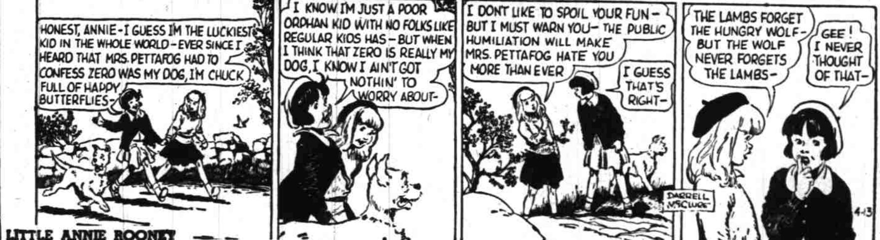
LITTLE ANNIE ROONEY