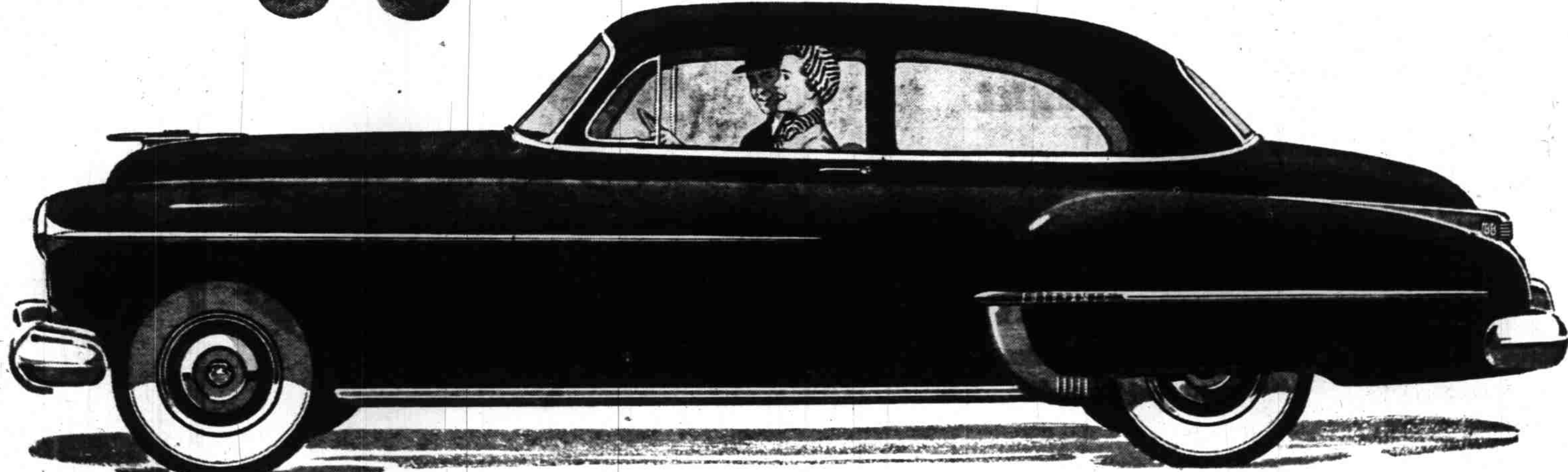
A GENERAL MOTORS VALUE

sure-footed maneuverability—its all-around driving ease—and solid gas savings! Your Oldsmobile dealer knows all this, too, and he would like nothing better than to arrange a "Rocket" ride for you! So see him today—and don't forget to ask him about the new price reductions on all models! Make a date with a "Rocket 8" . . . and Rocket Ahead with Oldsmobile!