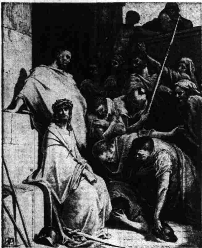
(Third of a Holy Week series by AP Newfeatures. Art from the painting by Gustave Dore. Text condensed from Luke 22:63-23:24.)

The men that held Jesus mocked Him, and smote Him. And when they had blindfolded Him, they struck Him on the face, and asked Him, saying, Prophecy, who is it that smote Thee? And many other things blasphemously spake they against Him.