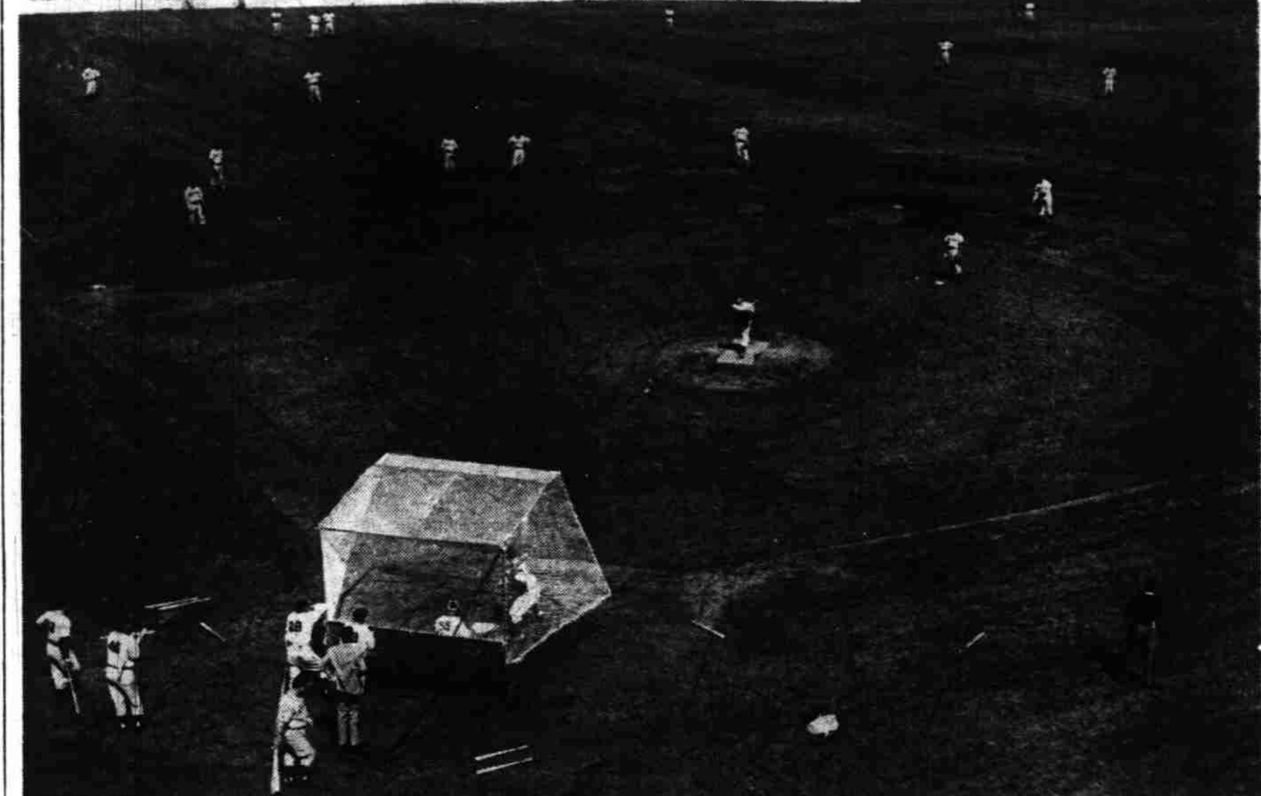
Springtime is baseball time, especially at Waters park during the sun- in preparation for opening of the WIL professional baseball seaso ny day yesterday wien the Salem Senators worked out on their April 18. (Story home field. More than 40 hopefuls were on hand for the practice on sports page.)