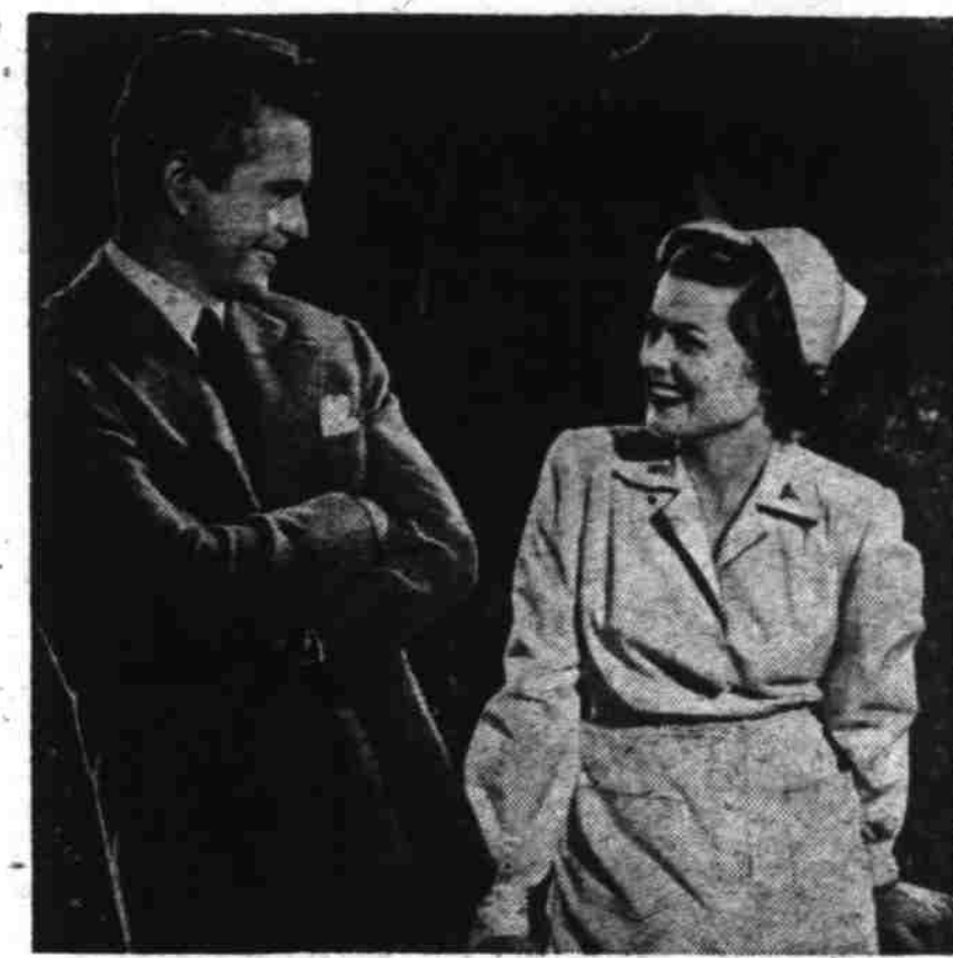
Larry Parks and Barbara Hale, co-starred in the technicolor picture "Joelson Sings Again," now at the Grand, at regular prices.