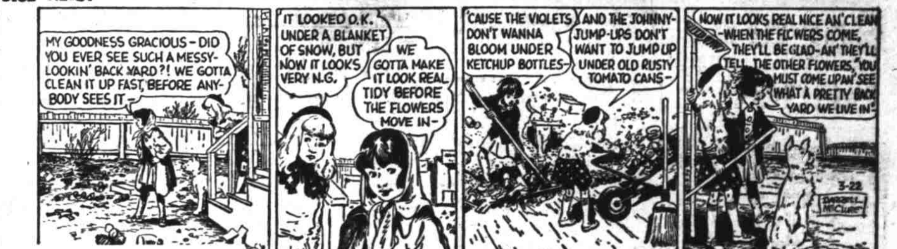
LITTLE ANNIE ROONEY