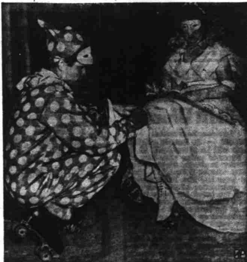
SKATERS HOLD MARDI GRAS —The Masked Queen of Skateland's Krewe has skates adjusted by a courtier at roller skaters' carnival ball during New Orleans Mardi Gras.