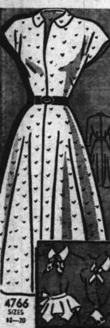
4766 SIZES 12-20 Anna Adams

Oh beautiful Accessory Dress! It's kind to your budget! Classic lines, adaptable collar. Frivolous fascinating accessories, in pattern too, give you many dresses in one! Pattern 4766 comes in sizes 12, 14, 16, 18, 20. Size 16 dress takes 3 1/2 yards 38-inch fabric. This pattern, easy to use, simple to sew, is tested for fit. Has complete illustrated instructions. Send TWENTY-FIVE CENTS in coin for this pattern to ANNE ADAMS, care of The Oregon Statesman, Pattern Department, P.O. Box 6719, Chicago 90, Ill. Print plainly YOUR NAME, ADDRESS, ZONE, SIZE, STYLE NUMBER. Don't miss our Anne Adams Pattern Book for Spring! Send Fifteen Cents more for your copy and let Anne Adams show you what to sew to be well-dressed! Single one-yard patterns, smart new fashions for everybody. A free pattern is printed right in the book—a stunning one-yard blouse!