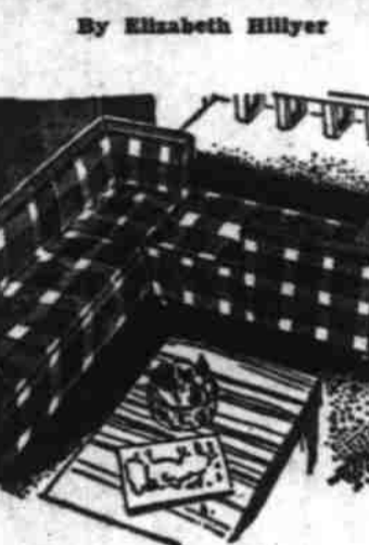
USE A PENCIL

Get out a pencil before you get out your pocketbook when the living room needs new upholstered furniture. The usual sofa and big chairs may not be your best bet at all. To make sure, draw the floor plan of the room and then sketch in a sofa and chairs. Now, on another floor plan, try sectional upholstered units. They come in so many sizes and styles there's no end to what you can do with arrangements. See if you can work out plans that fit the room better, crowd it less and offer more seating space and more comfort. When you're at this pencil plotting you can see for yourself that a well organized unit arrangement often makes a room look roomier even though it takes up more floor footage than scattered furniture.