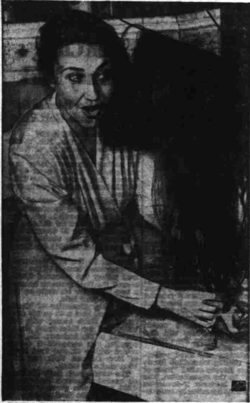
PLEASANT CHORE — Metropolitan Opera mezzo-soprano Blanche Thebom uses a coat hanger to see her work as she shampoos her five-foot three-inch tresses in New York home.