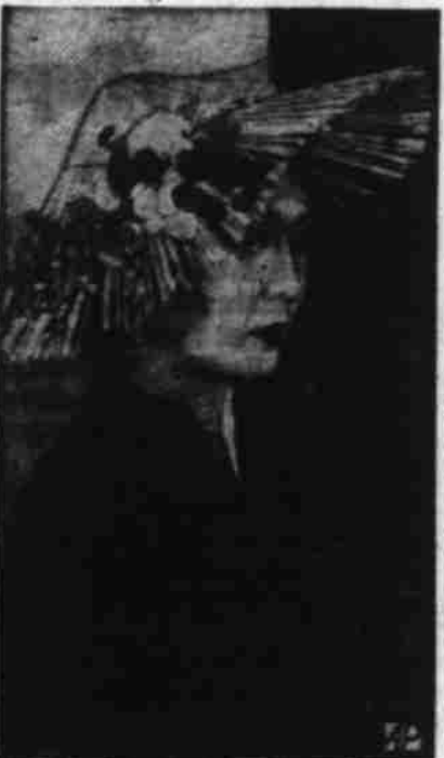
SPRING COOLIE — This Spring hat, inspired by the Chinese coolie hat, and shown by Dior, Paris, is made of two tiers of bamboo-like straw trimmed with field flowers.