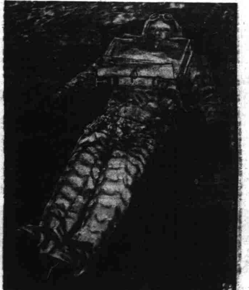
SUBMARINE ESCAPE SUIT — A new inflated submarine escape suit worn by a British Navy man at Portsmouth, England, holds a bulb which lights when immersed in salt water.