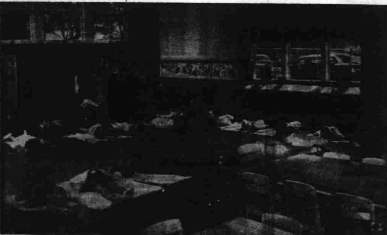
COMFORTABLE FLOOR — Children enjoy a daily nap on floor of a kindergarten at Bellflower, Cal., where radiant heating in the floor and electronic controls are a health factor.