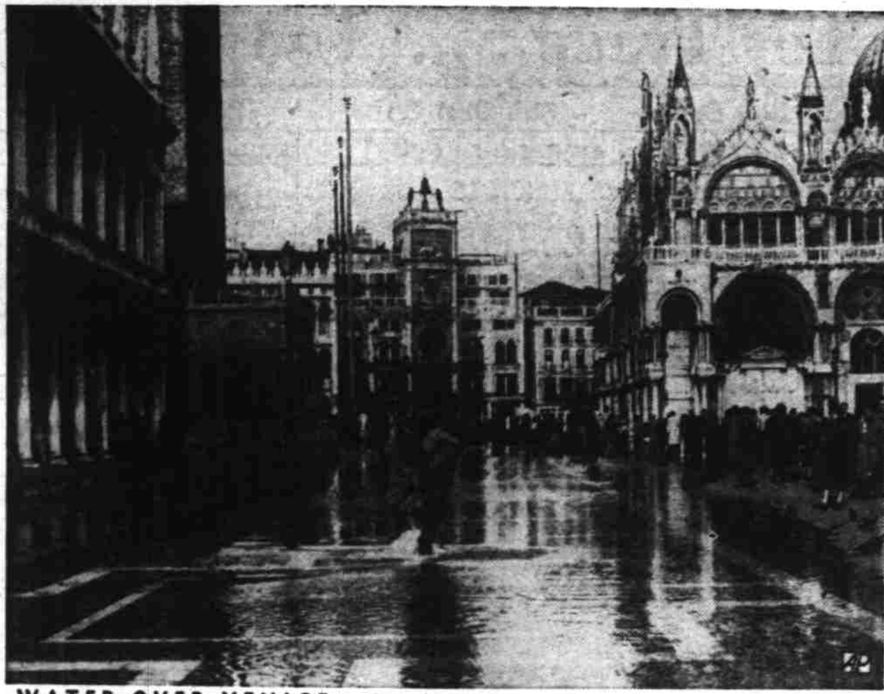
WATER OVER VENICE —A porter carries a pedestrian across St. Mark's Square, Venice, after a high tide overran the banks of the Grand Canal and flowed into the Square.

L'Anse, county seat of Beraga County, Michigan, was for years the site of a camp used by French explorers and missionaries.