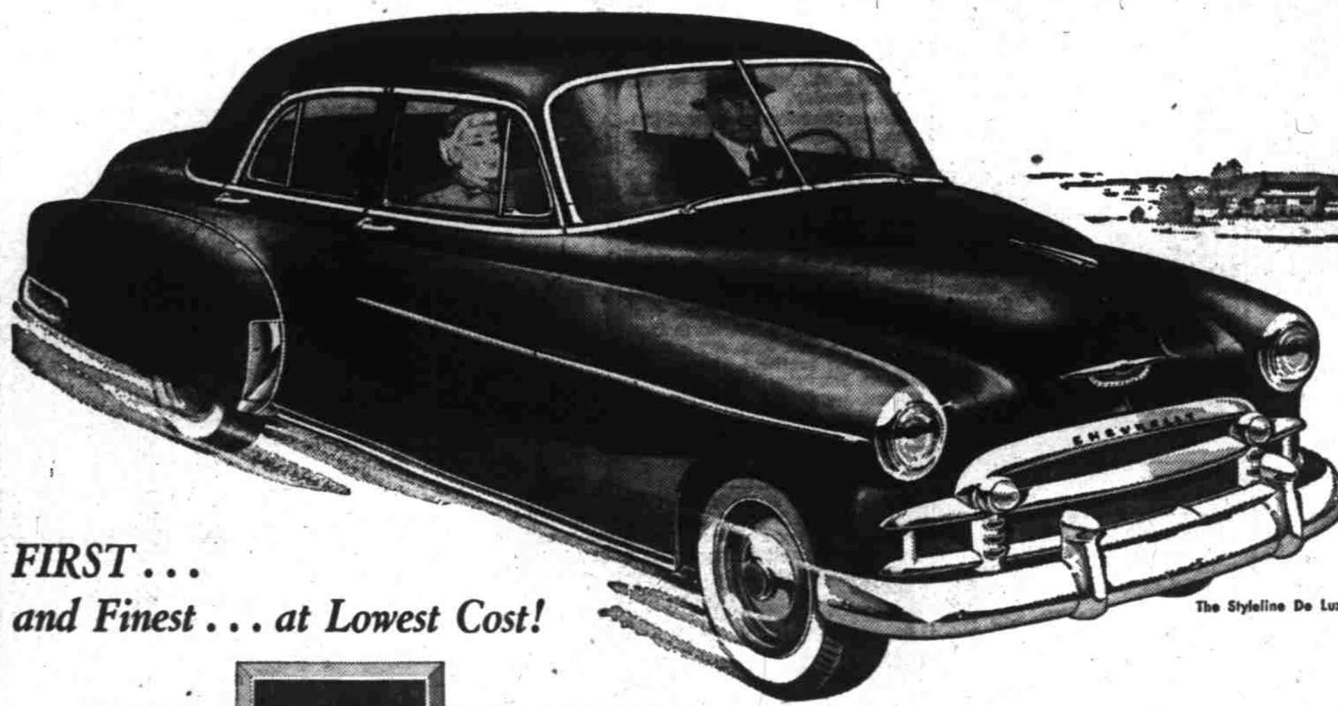
The Styleline De Luxe 4-Door Sedan

Chevrolet alone in the low-price field gives you highest dollar value... famous Fisher Body... lower cost motoring!