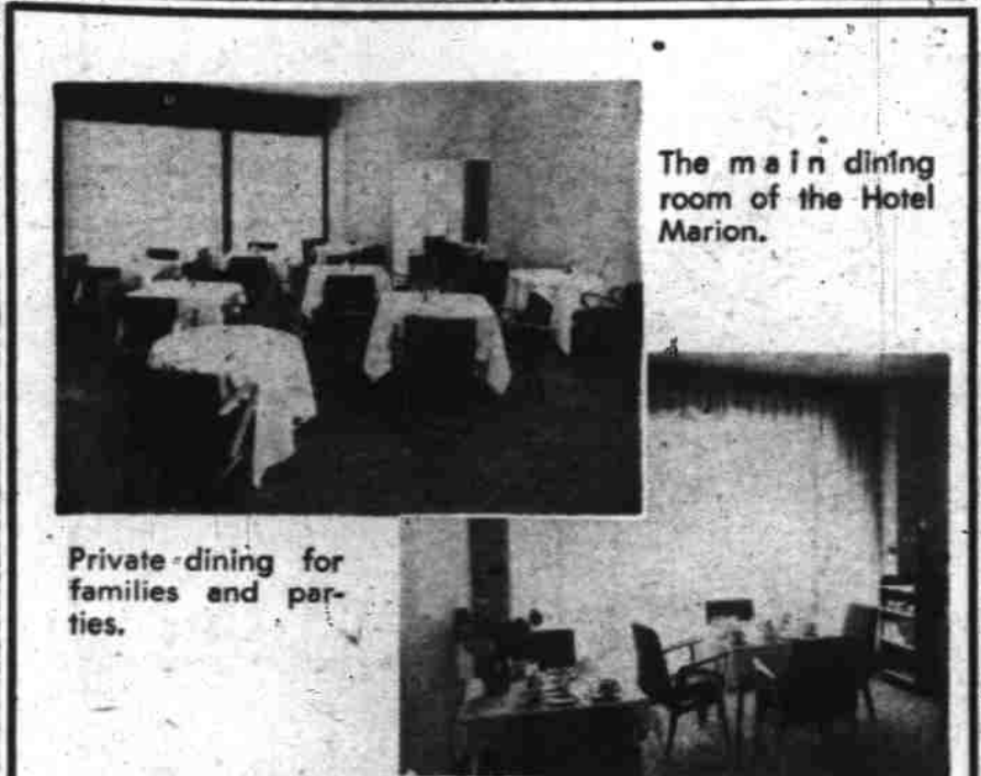
The main dining room of the Hotel Marion.