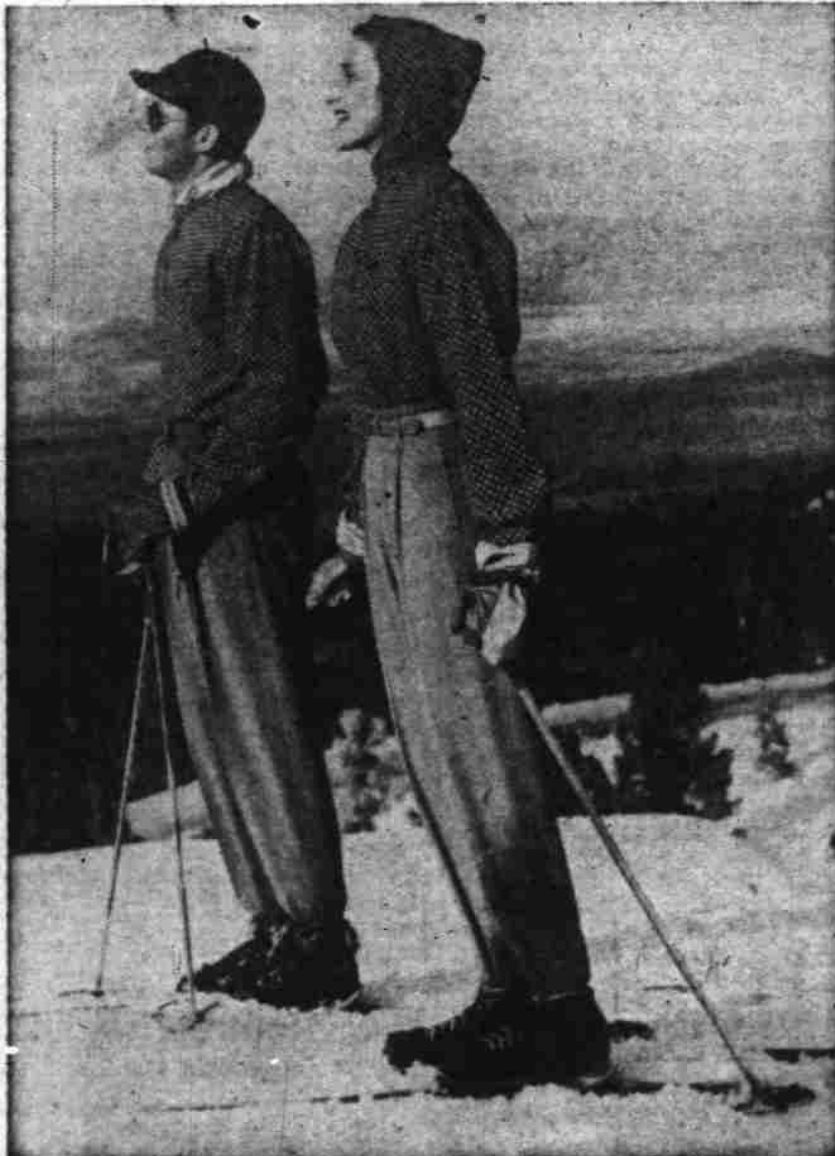
The patterns go skiing: The newest of the new in ski togs, are created from the fabric used for men's neckwear. They're reversible to solid color poplin, so you can be both bold and conservative. There are scores of patterns for the gals, including plaids, stripes as well as the foulards. The men have only a few of their necktie favorites, more conservative but just as colorful. There are also jacket styles, with matching headscarfs for the gals.