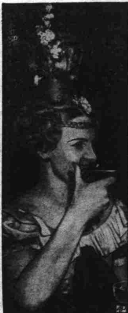
CARNIVAL HAIRDO —A model demonstrates a hairdo for the German pre-Lenten carnival period in the hair style show sponsored by the Munich Hairdressers Association.