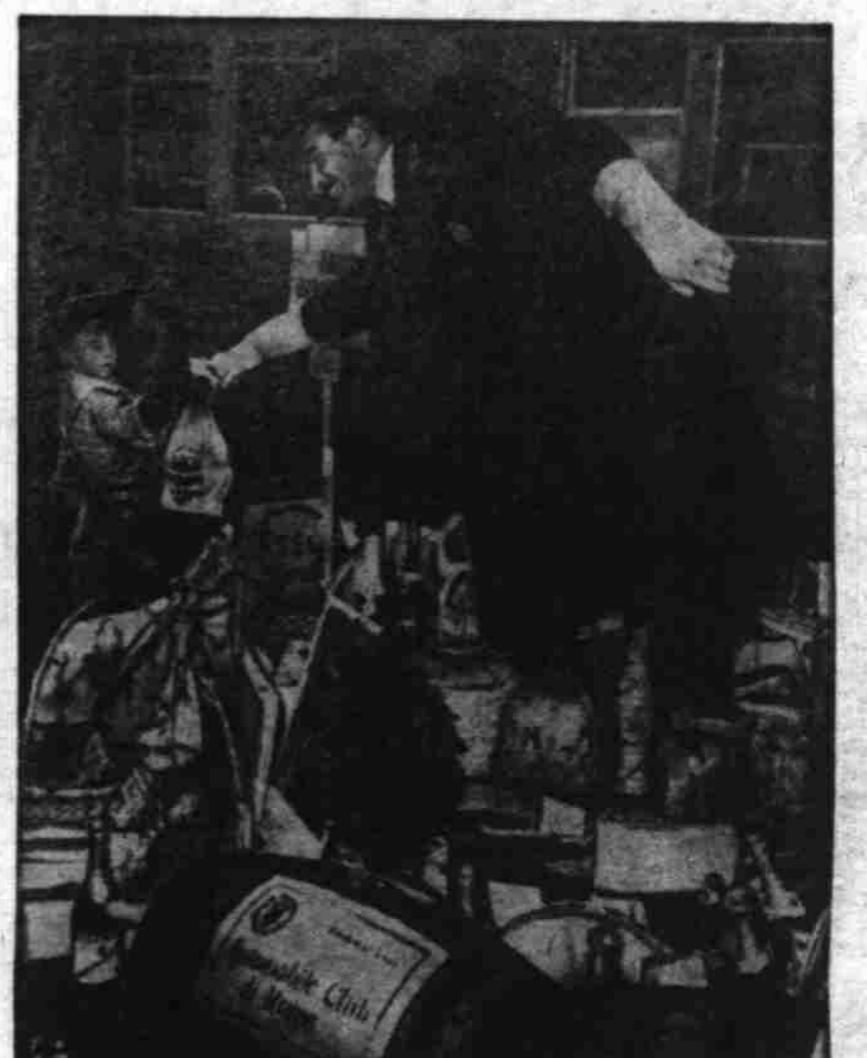
EPIPHANY DAY PRESENTS —A traffic policeman in the Piazza Venezia, Rome, Italy, adds a bottle of wine, presented by a youngster, to the gifts he has received on feast of the Epiphany, Jan. 6, which is celebrated like another Christmas.