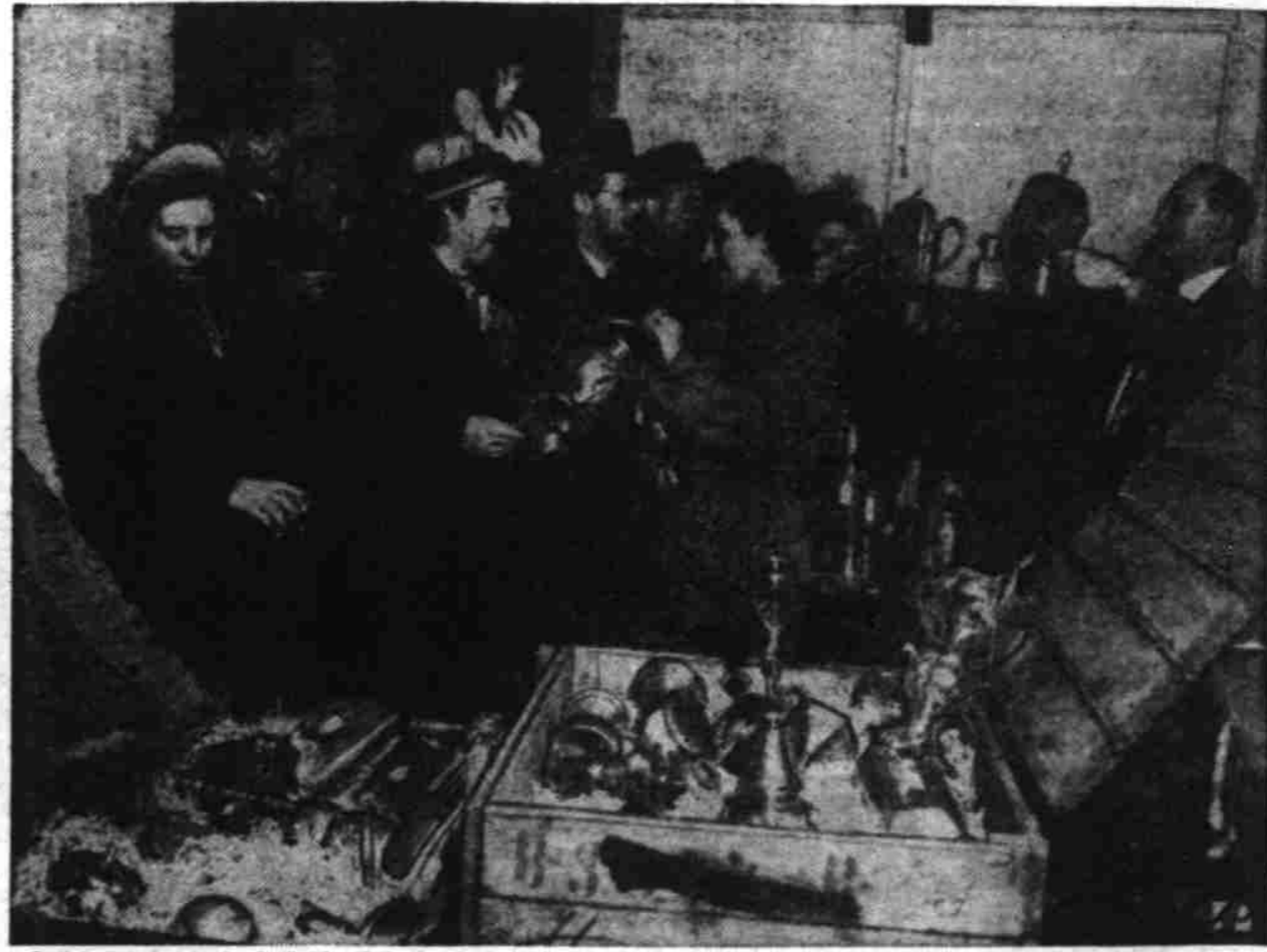
GERMAN LOOT FOR SALE —Prospective purchasers inspect some of the 28 tons of confiscated silverware found in German salt mine hideouts by American Army, on sale at New York's United Nations Galleries. International Refugee Organization will receive proceeds of sale.