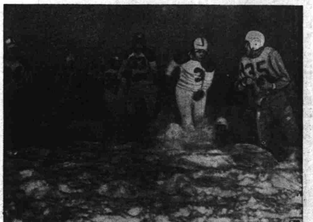
ICE BOWL GAME IN SNOW —University of Alaska and Ladd Air Force football teams battle in ten inches of snow in Ice Bowl game at Fairbanks, Alaska. University won, 3 to 0.