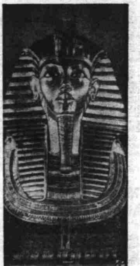
GOLDEN KING 'TUT' —Egyptian authorities, searching for tombs of 14 Pharaohs of 4,000 years ago, hope to find treasures like the gold mask (above) of King Tutankhamen.