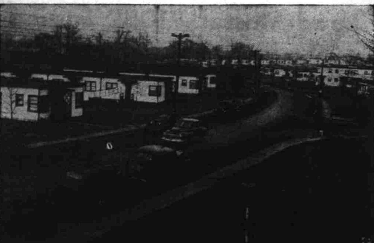
TOWNSPEOPLE BUY A COMMUNITY —Street in Winfield, N. J., 20 miles from New York, a community containing 700 houses which residents have voted to buy from the government for $1,250,000 through their own cooperative Mutual Housing Corporation.