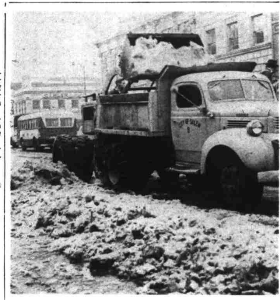
Operation Snowshovel With melting snow presenting a possible flood menace Salem city street crews are busy removing as much snow from streets as possible before gutters and basements are swamped. At left is a truck being loaded with snow scooped up by loader on South Commercial street, and at right is a truck dumping the dirty slushy snow into Shelton ditch at Liberty and Mill streets.

MONMOUTH, Jan. 20—(AP)—Despite being double-dry already Monmouth city fathers made plans today to go one step further.