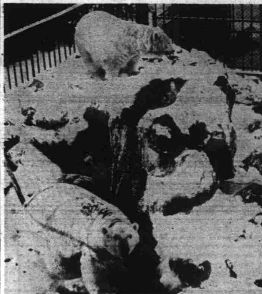
SEATTLE, Jan. 6 — These polar bears were right at home in the ice and snow yesterday at Woodland Park zoo here. After all, Ellen (upper) and her pal, Mishka, could dive in for a swim when they wanted to cool off. That glistening stuff in the center is ice.