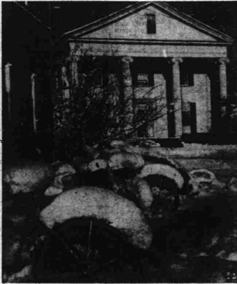
SNOWBOUND CYCLES — An all-night snowfall caught students of Smith College, Northampton, Mass., by surprise as they arose to find some of the 1,484 campus bicycles buried.