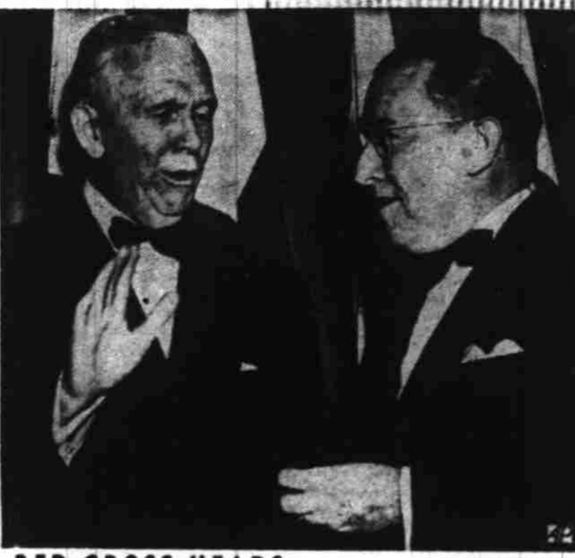
RED CROSS HEADS —Gen. George Marshall (left), new president of American Red Cross, chats with Basil O'Connor, former president, at a Washington dinner in O'Connor's honor.