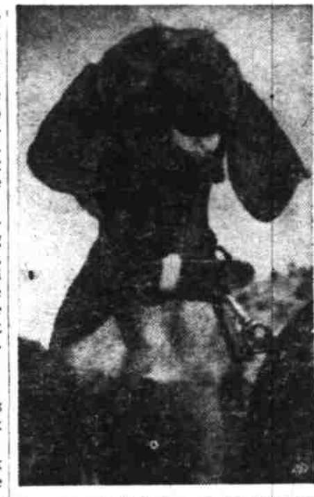
New breed of dog, a cross between a bloodhound and foxhound, proves adept at tracking down criminals in the southwest.

AP Newfeature Writer TUCSON, Ariz.—A new breed of dog is going to make it tougher for fugitive criminals in the southwest. It's a cross between a bloodhound and a foxhound. The type was developed by Dan Moore, who spent 11 years training bloodhounds at the Arizona state prison.