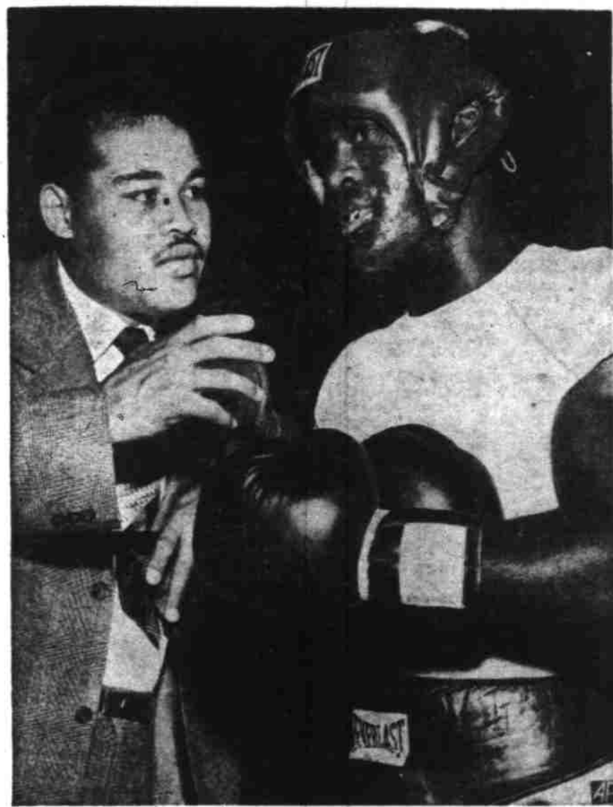
Ezzard Charles (right) NBA heavyweight king and Joe Louis, the retired world champion, are shown as they recently talked over points of the ring trade. Louis' current occupation with 10-round exhibition bouts has led to speculation that he may try a comeback — and the man he'd have to beat would be this same Charles.