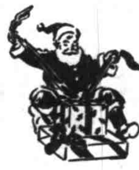
Buy His Gift From