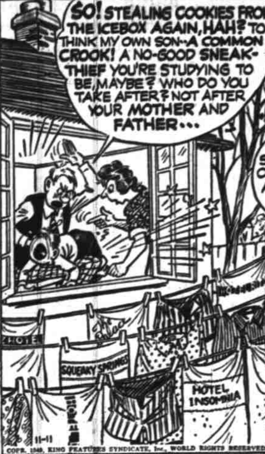
Copyright © 1949 King Features Syndicate, Inc. World Rights Reserved