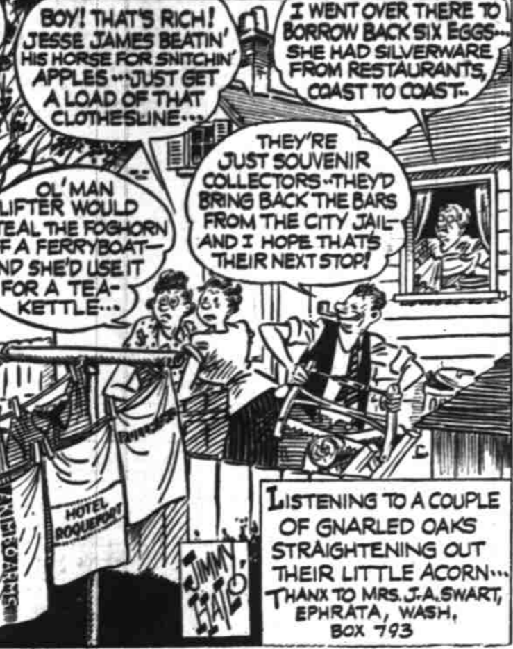
Copyright © 1949 King Features Syndicate, Inc. World Rights Reserved