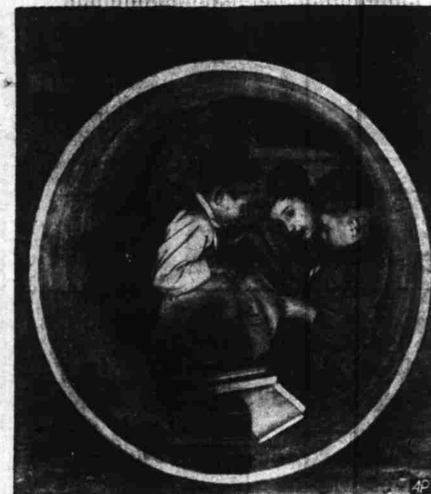
PIPELINE CONFERENCE—Things are quite crowded in this Berlin sewer pipe as a trio of youngsters hold an after-school "jam session" on arithmetic problems.