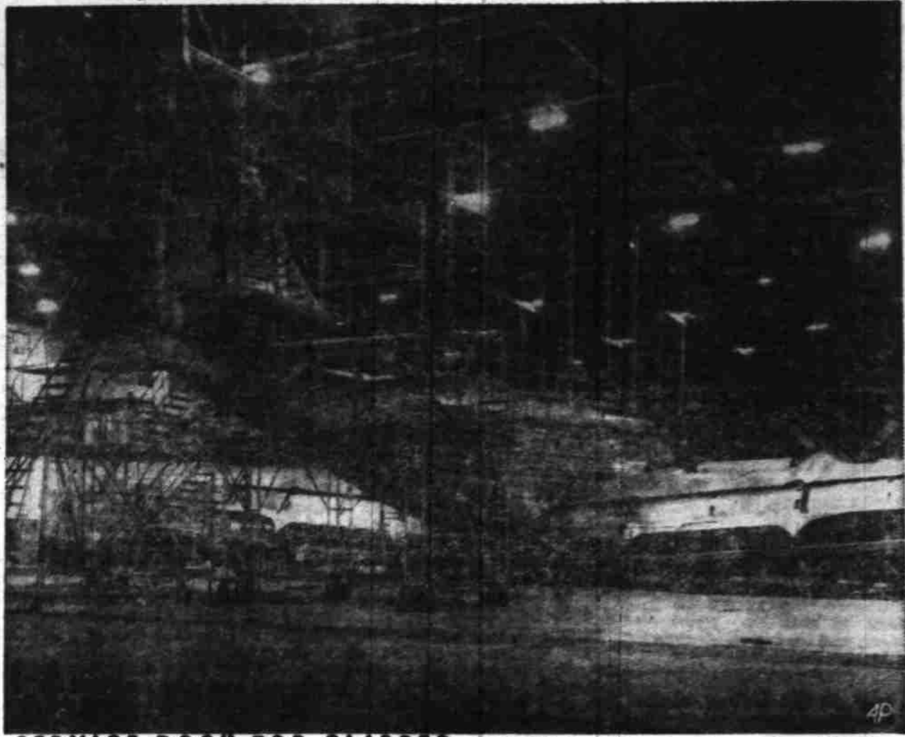
SERVICE DOCK FOR CLIPPER —A double-deck clipper undergoes inspection at new Pan American overhaul base in Miami. Steel tubing and trusses contain 75 tons of metal.