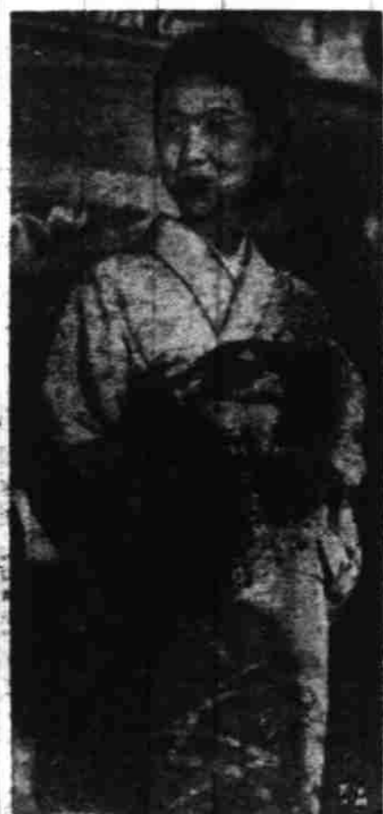
EN ROUTE TO U.S. —Kinuyo Tanaka, Japanese movie star, arrives at Tokyo Airport to start her tour of Honolulu and U.S., by permission of SCAP, U.S. occupying authority.

But the coast guard at Talamulan has ignored this one black