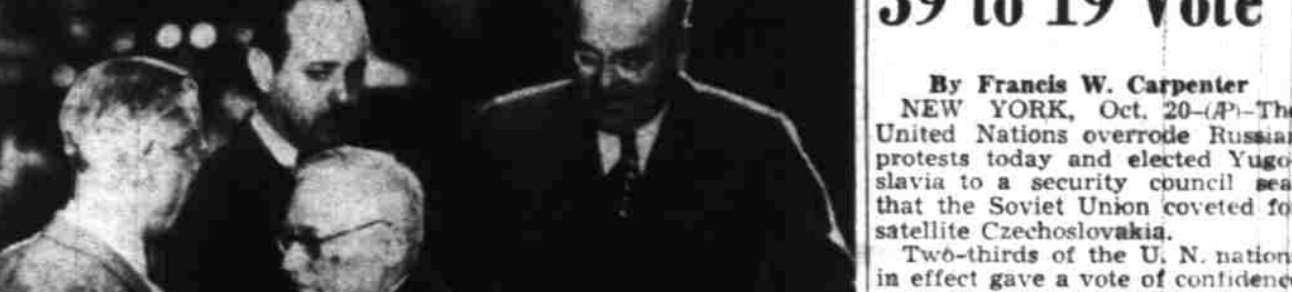
NEW YORK, Oct. 20—Russia's Andrei Y. Vishinsky (center) casts his ballot in today's voting at United Nations General Assembly for seats on the Security Council. Following him, ballot in hand, is Warren Austin, U.S. delegate. Despite last minute protest of Vishinsky, Yugoslavia won Security Council seat over Soviet-sponsored Czechoslovakia. Vote was 39 to 19.

WASHINGTON, Oct. 20-(AP)—President Truman, saying he is unhappy about deficit spending, made it plain today he will ask congress for higher taxes next year. He told his weekly news conference that he will recommend ways to prevent the government operating in the red, and if there is any other way to do it than by increasing taxes he would like to know it. Republicans and some democrats immediately responded with a call for a reduction in expenditures rather than a tax raise. Questioned about the prospective $5,000,000,000 deficit for the year ending next June 30, the president said it was not his fault. He added that the republican 80th congress passed a rich man's tax cut bill and there are what he called fixed charges of $35,000,000,000 in the budget which must be met. He said he will recommend to the January session of congress means of meeting the government's money needs and it may mean a revision of taxes. A reporter then put this question: "Your remedy may, if your study shows it, call for an increase in taxes?" The president replied, with permission to quote: "Certainly, we've got to find money to run the government and that's all there is to it."