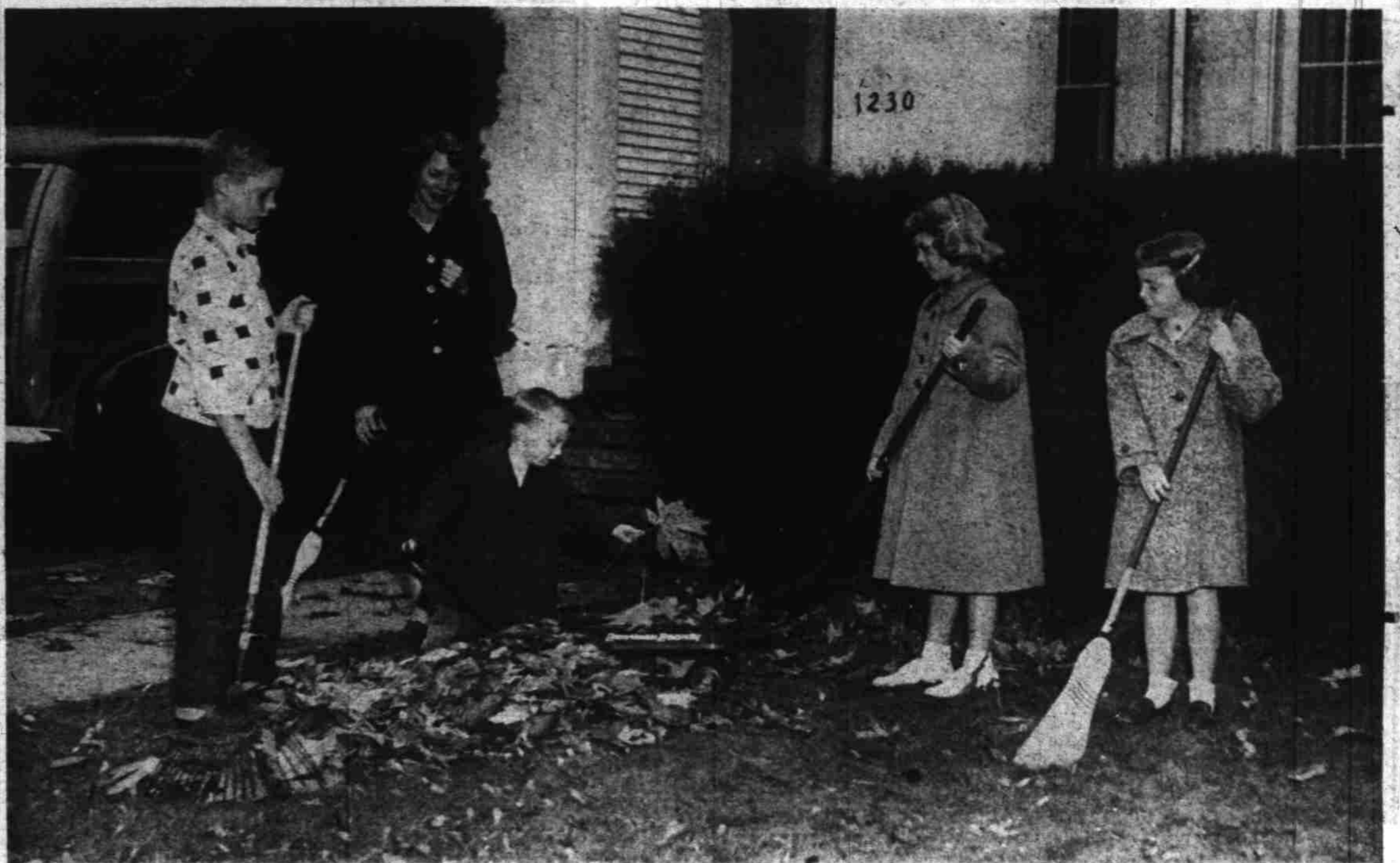
And now that it's fall again . . .