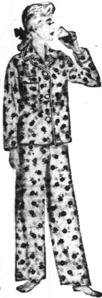
Flannelette Jamarettes 2.98

Comfy yoke front with eyelet trim. Vat dyed prints. Sizes 34 to 40.