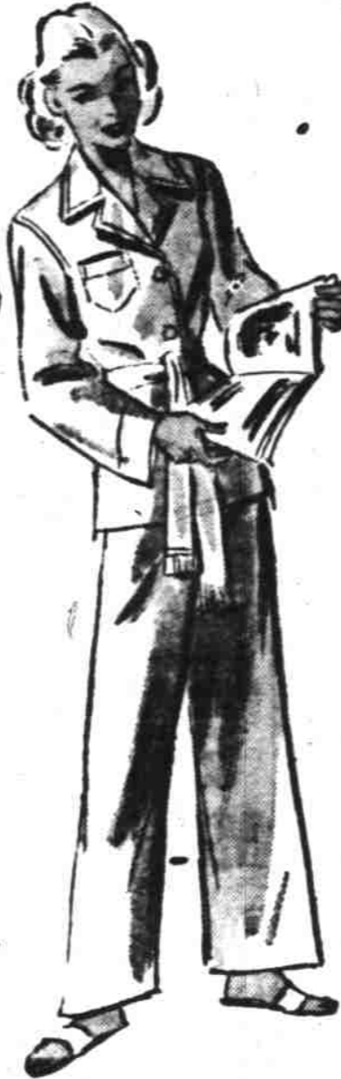
Cozy Sanforized Flannelette Pajamas 3.49

Sanforized vat dyed pastel flannelette. Sizes 34 to 44.