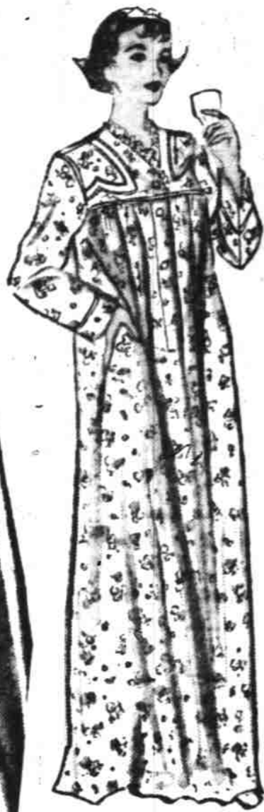
Sanforized Flannelette Gowns 2.98

Comfy yoke front with eyelet trim. Vat dyed prints. Sizes 34 to 40.