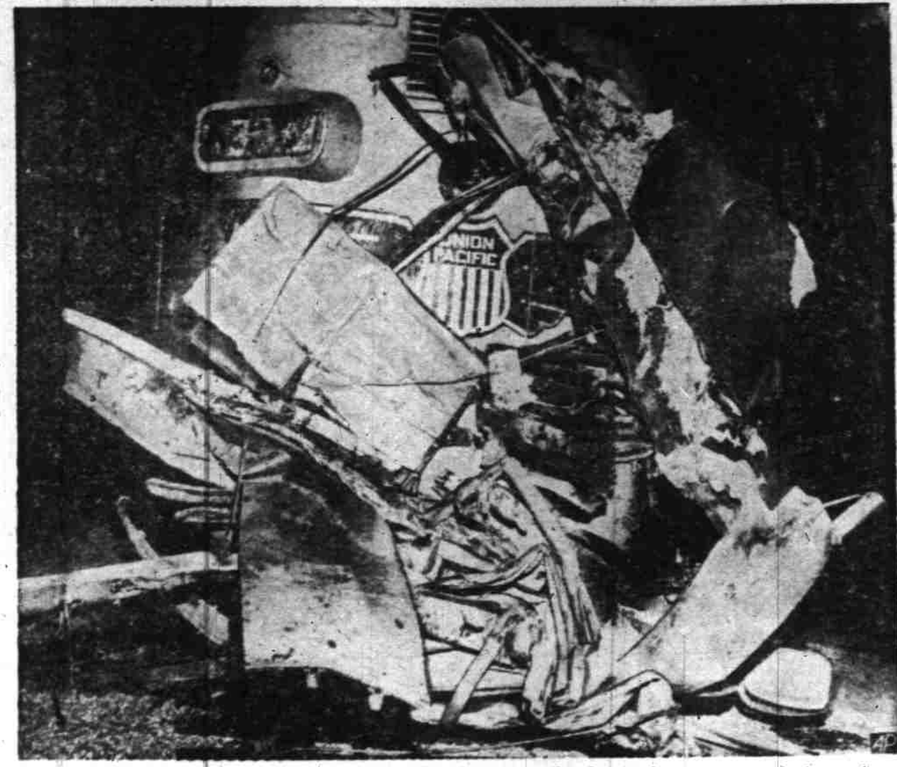
ONTARIO, Calif.-The wreckage of an airforce bus hangs on the front of a passenger train engine a mile from the scene of a grade crossing at Ontario. Cal. where the bus was struck. Sixteen bus passengers were killed and five hurt. (AP Wirephoto to the Statesman.)

I Sixteen Killed in Bus-Train Crash and and The warried dans and and and and and