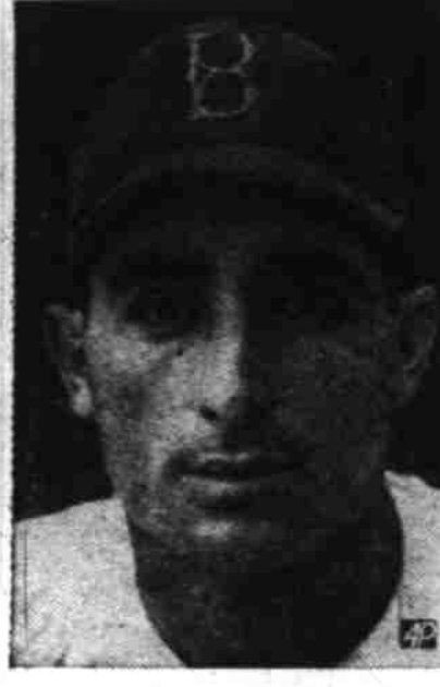
CARL FURILLO Dodger clouter.