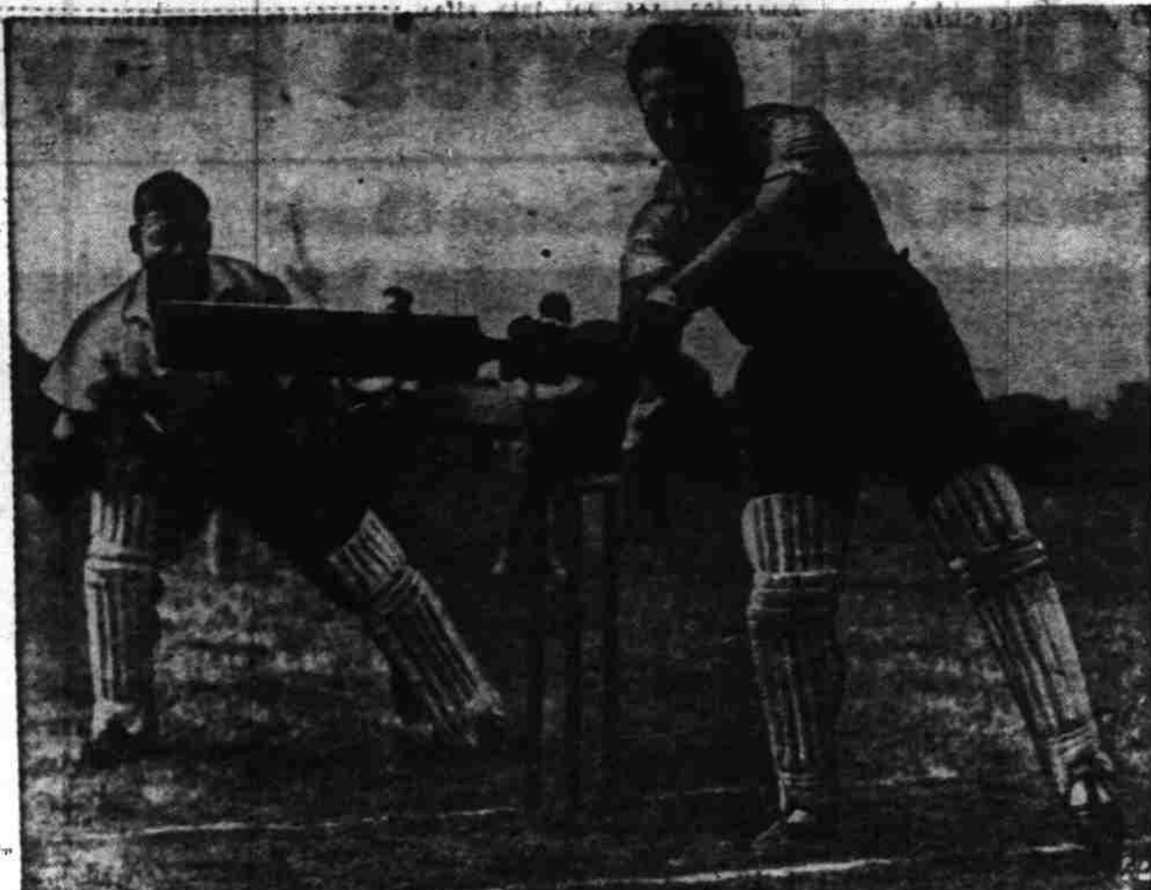
BOXER SWINGS —Lee Savold, U. S. boxer, whose match with British heavyweight champion Bruce Woodcock has been postponed, swings in a cricket match while training at Sussex, England.

The net proceeds from the show are to be used as a nucleus for an emergency fund for the community.