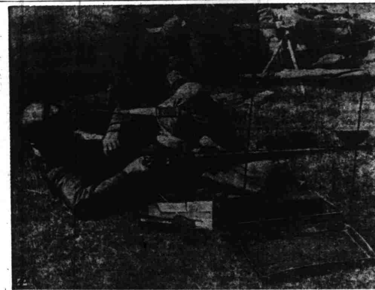
AIDS TO MARKSMANSHIP —A competitor on the 1,100-yard range in the national rifle shoot at Bisley, England, straps his forehead and left knee, using his right knee as a rest.