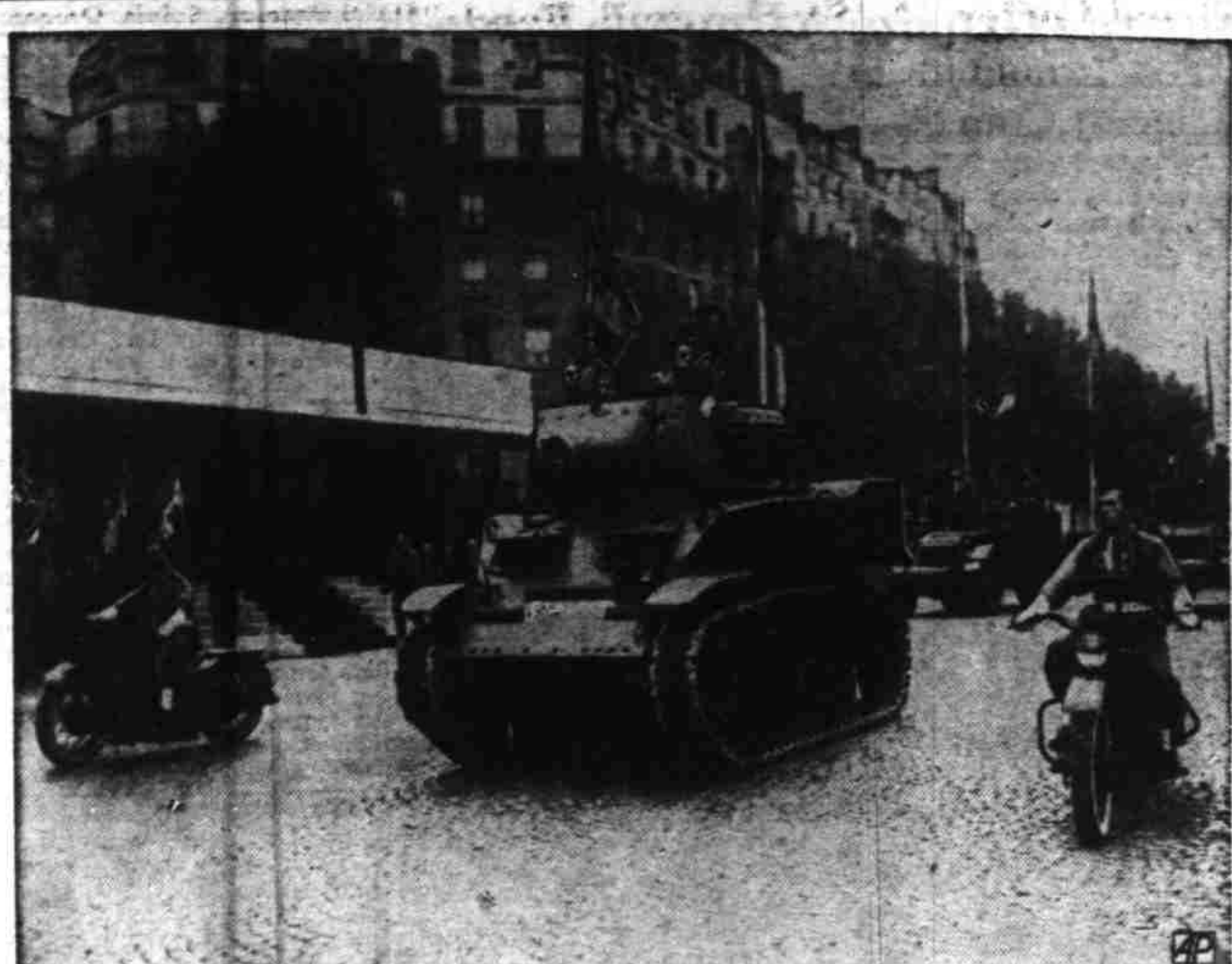
PARIS REMEMBERS ITS LIBERATION —Tanks pass the reviewing stand during ceremonies in which the former Place de la Ferte d'Orleans, Paris, was renamed Place du 25 Aout in commemoration of the liberation of the city, in World War II, August 25, 1944.