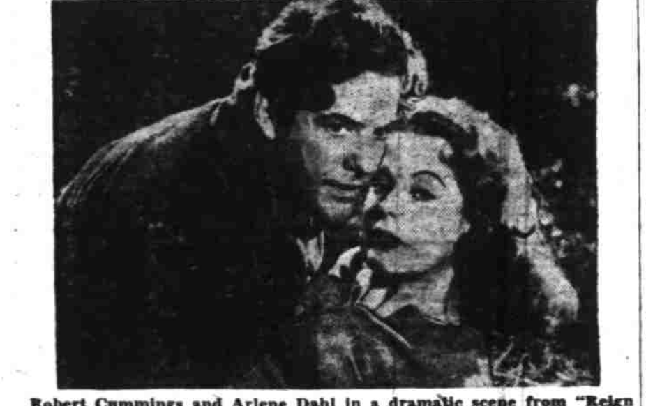
Robert Cummings and Arlene Dahl in a dramatic scene from "Reign of Terror," an Engle-Lion release, at the State tomorrow, with "Ride, Ryder, Ride."