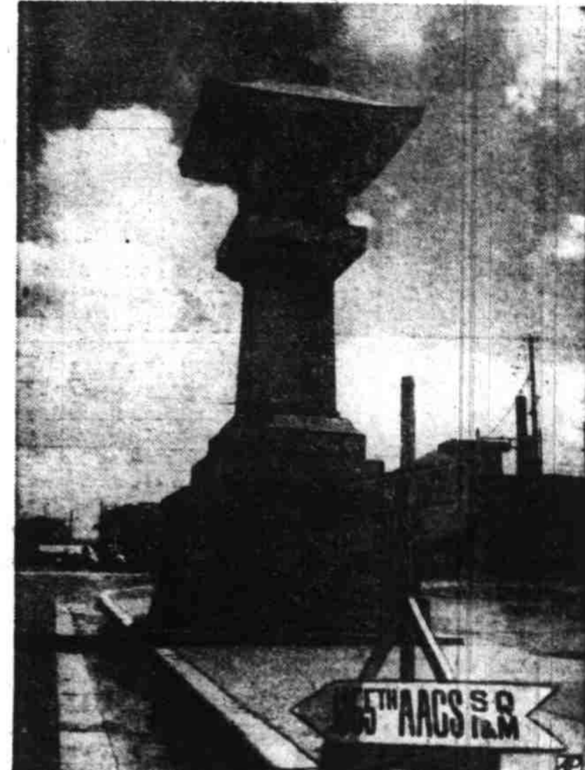
TOKYO FOUR YEARS LATER —Entrance to U. S. Army Washington Heights housing area, formerly grounds of Meiji Temple, Tokyo, has error in sign to add Japanese touch.