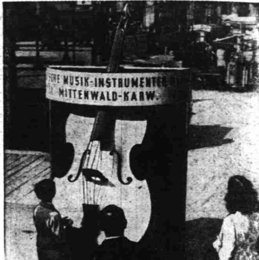
CALL TO MUSICIANS —A mammoth violin in the Munich railroad station advertises Germany's first fair for musical instruments at Mittenwald, noted for violin production.