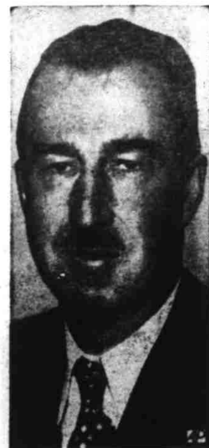
MINISTER —The nomination of Nathaniel P. Davis (above) as Minister to Hungary has been confirmed by the Senate. Confirmation had been held up for more than two months.