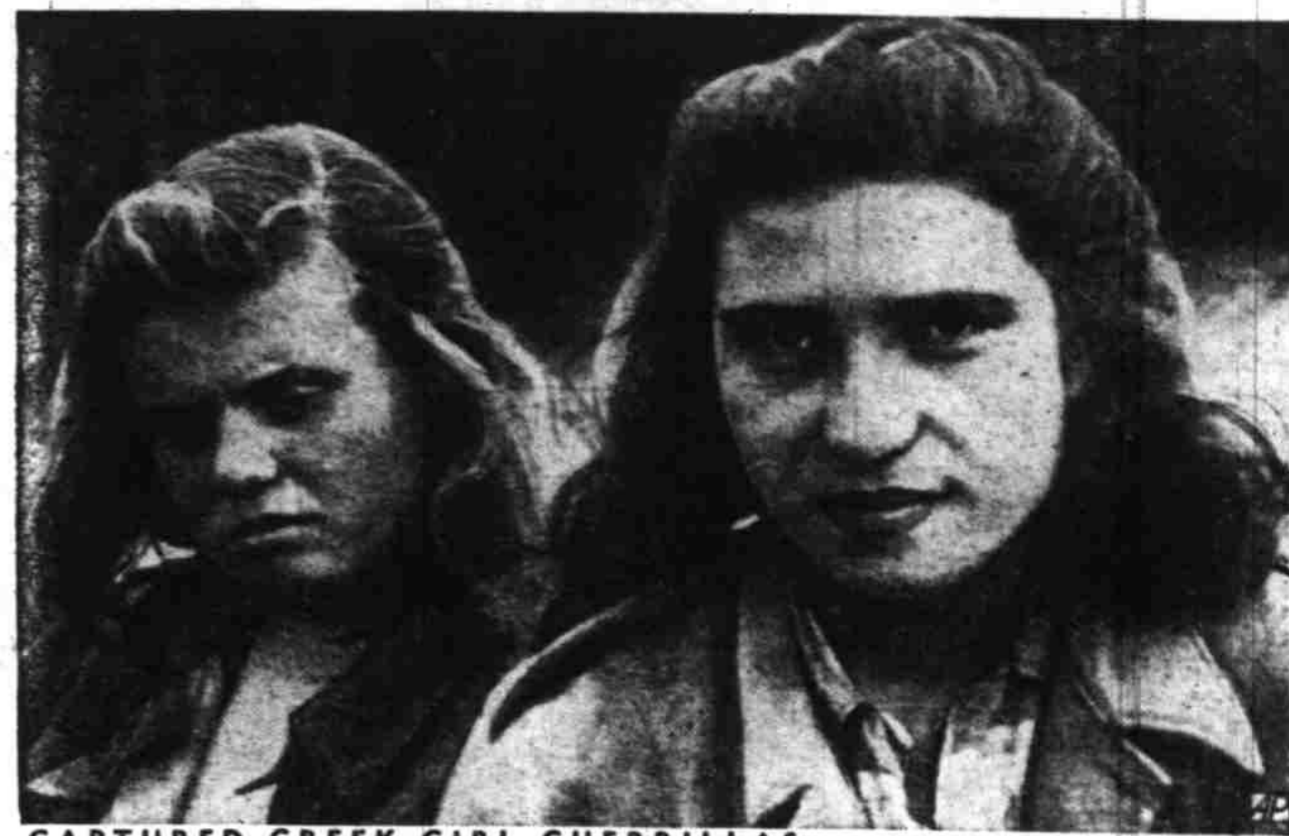
CAPTURED GREEK GIRL GUERRILLAS —These two young girls, one downcast and the other smiling wanly, were among the guerrilla captives brought back from the Grammos Mountains by Greek government forces after the recent drive to clear the area of communists.