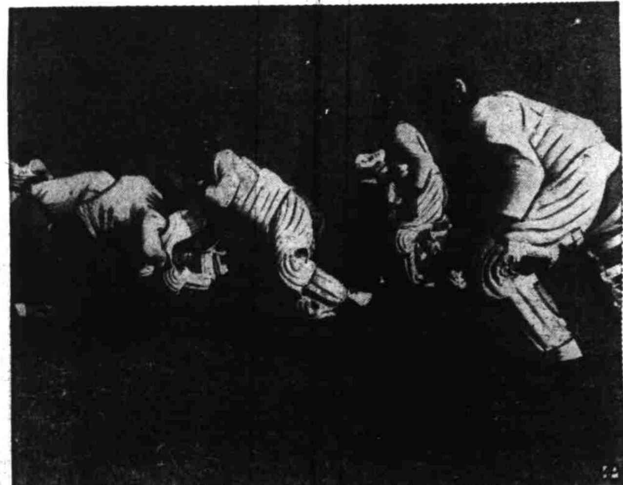
PROTECTING THE DEFENSE MEN —Defense men (right) of Southern Methodist football squad are equipped with protective padding for daily scrimmages at Dallas, Texas.