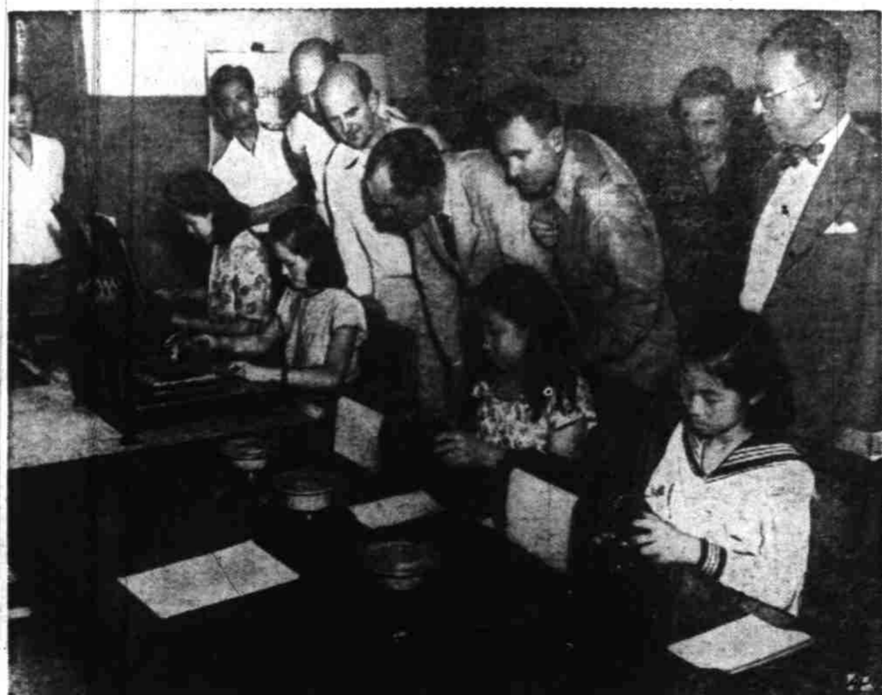
NEW JAPANESE TYPEWRITERS —Allied personnel in Tokyo watch the operation of new Japanese typewriters with cylindrical beds instead of the old-style flat bed at left.