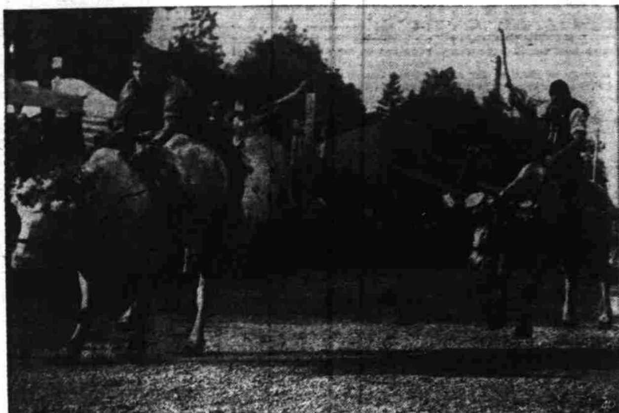
IN THE STRETCH AT DACHAU —Oxen jockeys urge their bucking steeds in the "Grand Prix de Dachau" during a carnival near the one-time concentration camp in Germany.