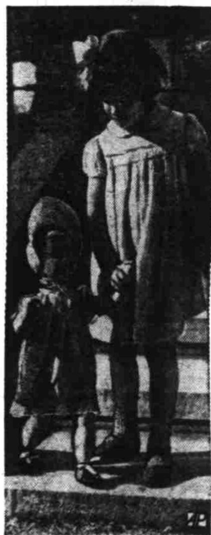
WALKING DOLL —"Erica," a walking doll, is led on its first promenade by proud "mamma" in preparation for the autumn fair of the Austrian toy industry in Vienna.