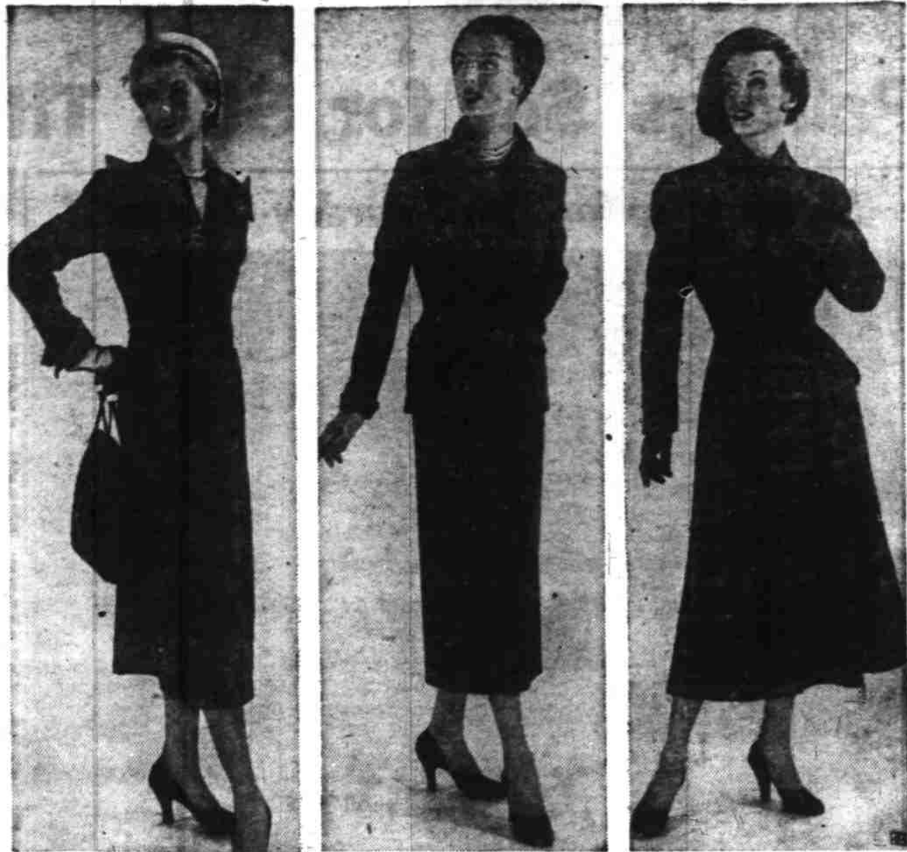
Chiffon weight... Adele Simpson uses sheer tweed in a grey diamond weave for her fly-front coat dress with wing pockets.