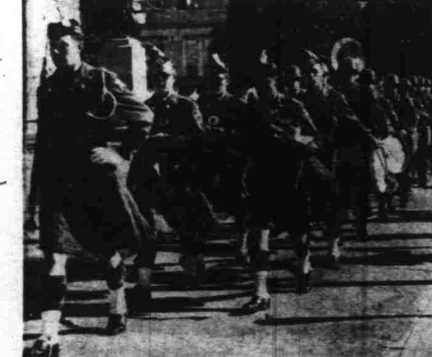
Shown above is the famous bagpipe section of the 2nd infantry regimental band from Ft. Lewis which will return to Salem to participate in the state fair next month. Many valley residents will remember the 2nd infantry band appearing during the recent American Legion convention.