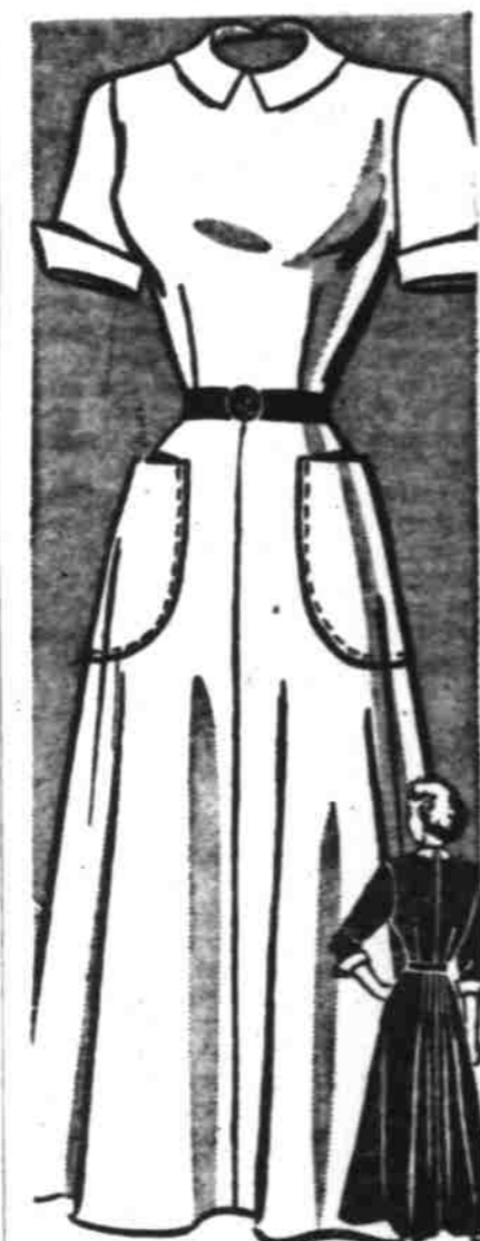
PATTERN 4576 SIZES 12-20

Tell the world you have perfect taste! Wear this chic casual with its trim details. Stitched pleats release fullness at back and there are no side-skirt seams!