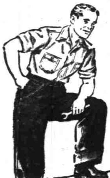
Double Duty Bandtop Overalls

For sports, school or work... one of the toughest jackets you can buy! Premium brown horsehide, fully nylon lined and stitched. Belted 2-pleat sport back, adjustable side straps. Sizes 36 to 46 at Sears typical low price today!