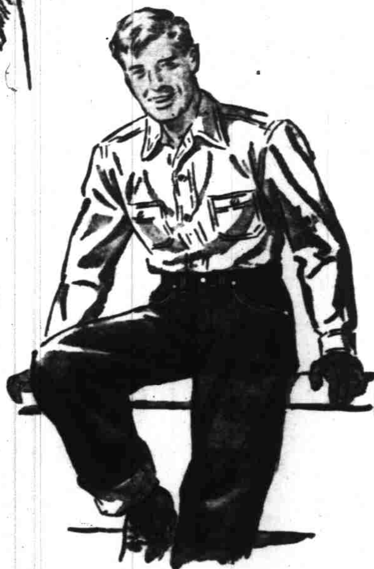
11 oz. Western Style Jeans

High back style, 9-oz. blue denim. Sanforized, max. fabric shrinkage 1%. Main seams triple stitched; waist sizes 30-50 in.