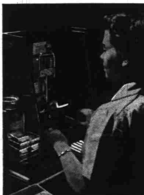
Everything's under control! Lucky Strike scientists supervise intricate tests daily to guarantee that the weight, size, density and firmness of your Lucky Strike are always right. Such details are rigidly controlled to guarantee you a truly finer cigarette.

Armed with this confidential, scientific information—and their own sound judgment—these men go after finer tobacco. This fine tobacco—together with scientifically controlled manufacturing methods—is your assurance that there is no finer cigarette in the world today than Lucky Strike!