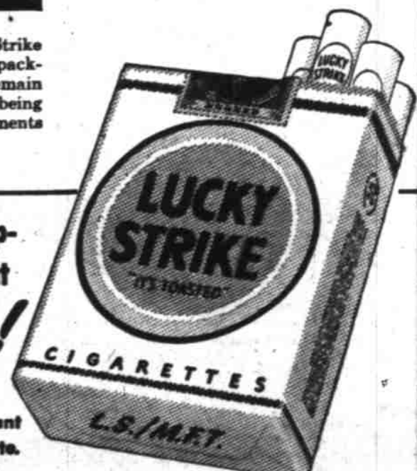
COPL., THE AMERICAN TOBACCO COMPANY

We know: LUCKIES PAY MORE for fine tobacco (millions of dollars more than official parity prices) We are convinced: LUCKIES PAY MORE for cigarette research