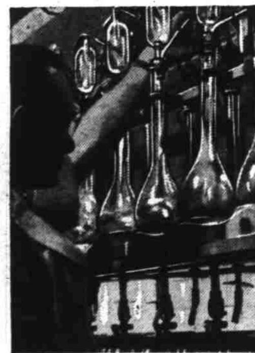
Testing tobacco. Samples from every tobacco-growing area are analyzed before and after purchase. These extensive scientific analyses, along with the expert judgment of Lucky Strike buyers, assure you that the tobacco in Luckies is fine.