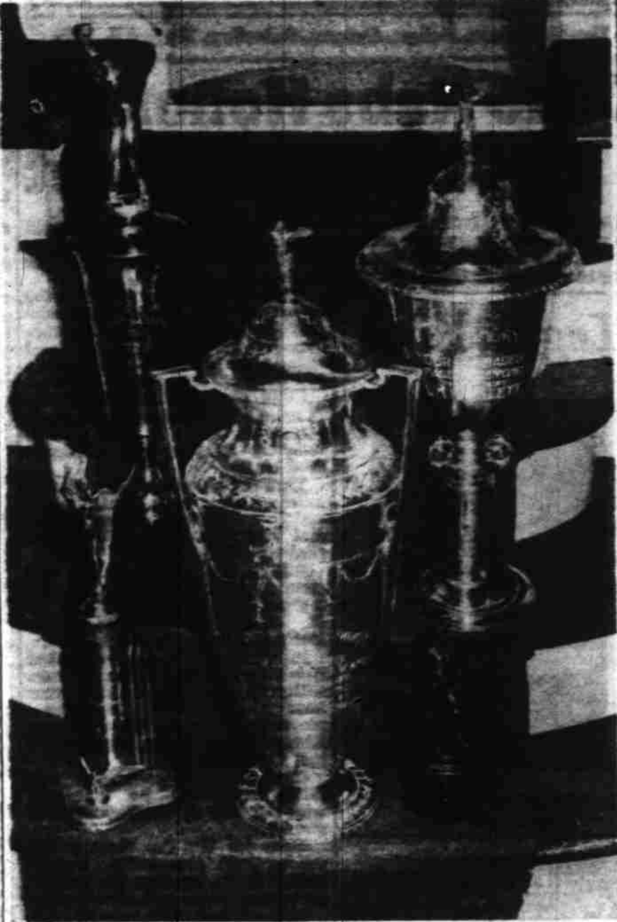
These trophies will be awarded to deserving posts and individuals during the American Legion convention here this week. In front, left to right, are best post Boy Scout sponsorship; C. W. Brown drum and bugle corps trophy; Boy Scout activity award; top left is the annual golf tournament trophy; and top right is the W. E. Follett cup commemorating departed comrades.