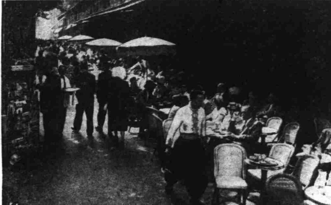
CENTER OF OUTDOOR CAFE LIFE IN PARIS —Parisians and summer visitors gather at the world-famous Cafe de la Paix, on the Place de l'Opera in the center of Paris.