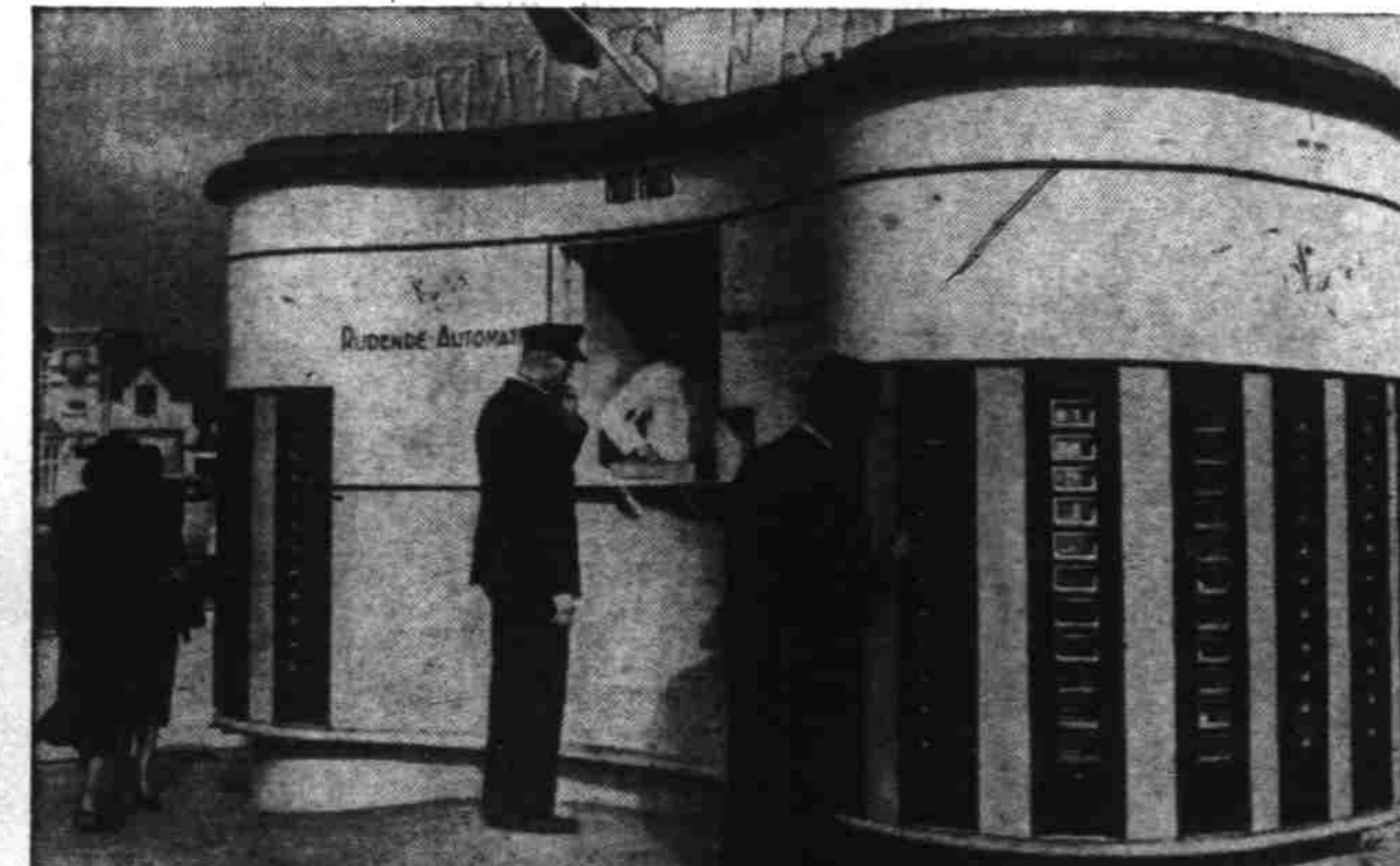
SIDEWALK AUTOMAT —Hot food and sandwiches are available, with every item one kwarke (ten cents) in this outdoor automat on the beach at Zandvoort, near Amsterdam, Holland.