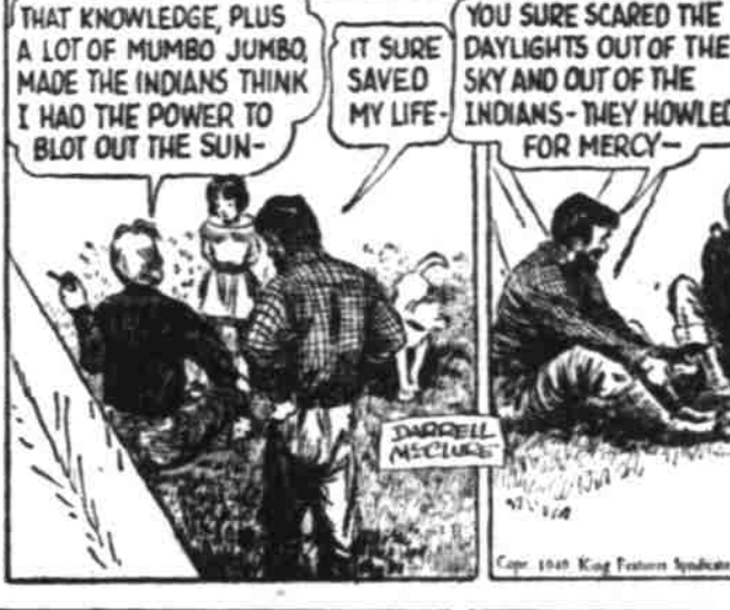
DAYLIGHTS OUT OF THE AN'ANIMALS SKY AND OUT OF THE WAS SCARED-MY LIFE- INDIANS-THEY HOWLED T WAS