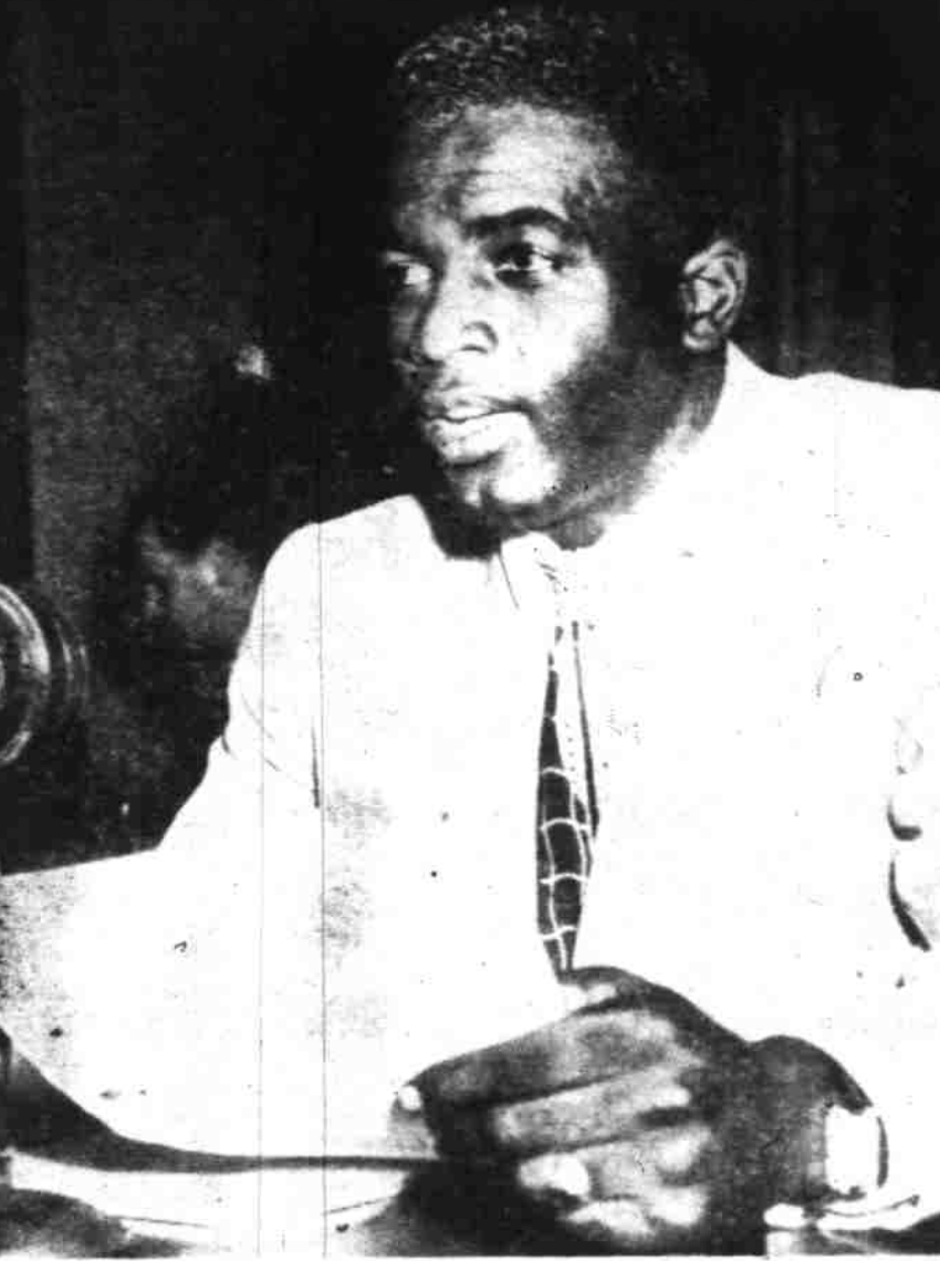
WASHINGTON, July 18 —Jackie Robinson, the Brooklyn Dodgers, sparking second baseman, tells the House Un-American activities committee today that if singer Paul Robeson "wants to sound silly" in public, "that's his business." Robinson said negro Americans would fight for this country "against Russia or any other enemy."