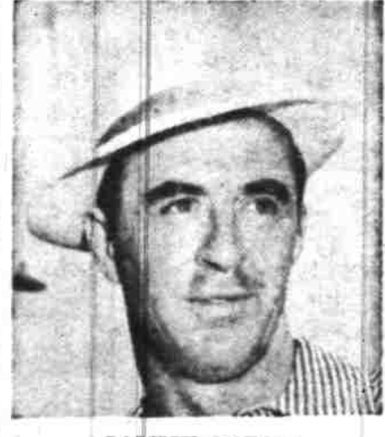
SAMMY SNEAD 2600 More Bucks