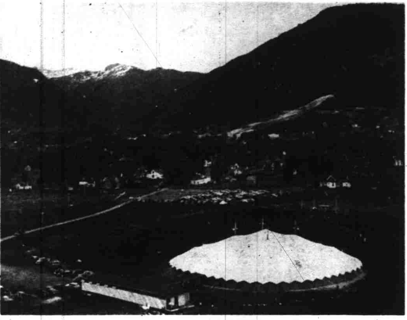
ASPEN, Colo., July 13 - High in the Rockies, 7,844 feet in elevation, the Goethe Bicentennial Convocation and Music festival is being held here at Aspen. Intellectual and musical genius from all over the world is paying homage to the life, work and con temporary music of the philosopher-poet Johann Wolfgang von Goethe in the amphitheater shown in the foreground above. It is estimated that over 100,000 persons, intellectuals, musicians and those who come to see what the celebration is all about will have visited the little town during the three-week celebration.