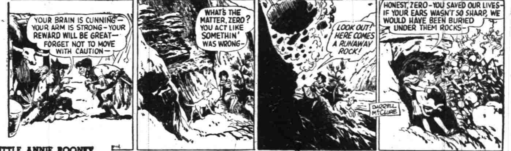
LITTLE ANNIE ROONEY