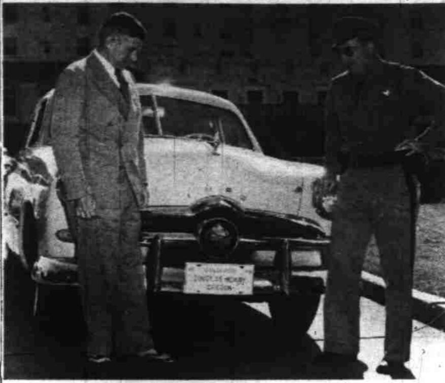
Yes, politics does make strange bedfellows, as illustrated above where Gov. Douglas McKay, in private life the Salem Chevrolet dealer, poses with a 1949 Ford. It all came about recently at Colorado Springs, Colo., where Ford Motor Co. provided new Fords as temporary official cars for dignitaries at a governors' conference. Fellow at the right is a Colorado state patrolman.