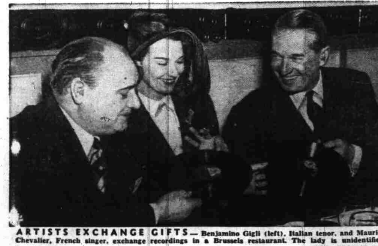
ARTISTS EXCHANGE GIFTS —Benjamin Gigli (left), Italian tenor, and Maurice Chevalier, French singer, exchange recordings in a Brussels restaurant. The lady is unidentified.