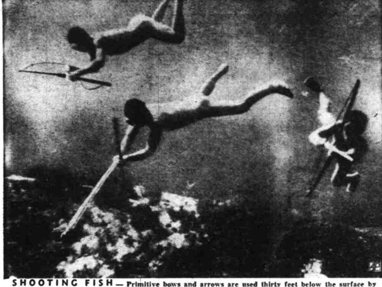
SHOOTING FISH —Primitive bows and arrows are used thirty feet below the surface by the diving fishermen of Tanegashima, near Kyushu, Japan. They swim all year round, hiding behind rocks under water to corner schools of fish in dead ends. Only their goggles are modern.