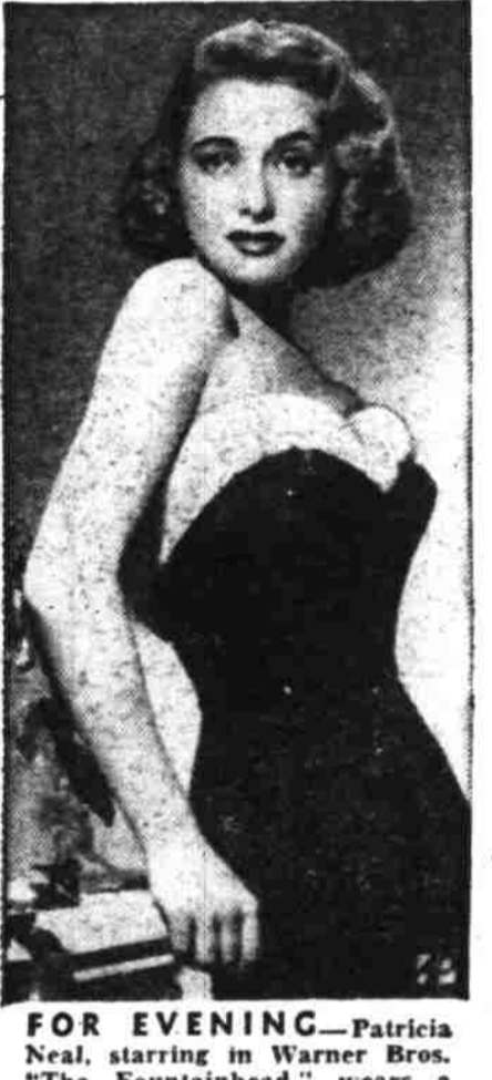
FOR EVENING —Patricia Neal, starring in Warner Bros. "The Fountainhead," wears a black, crepe strapless evening gown with a band of white ermine on the bodice.