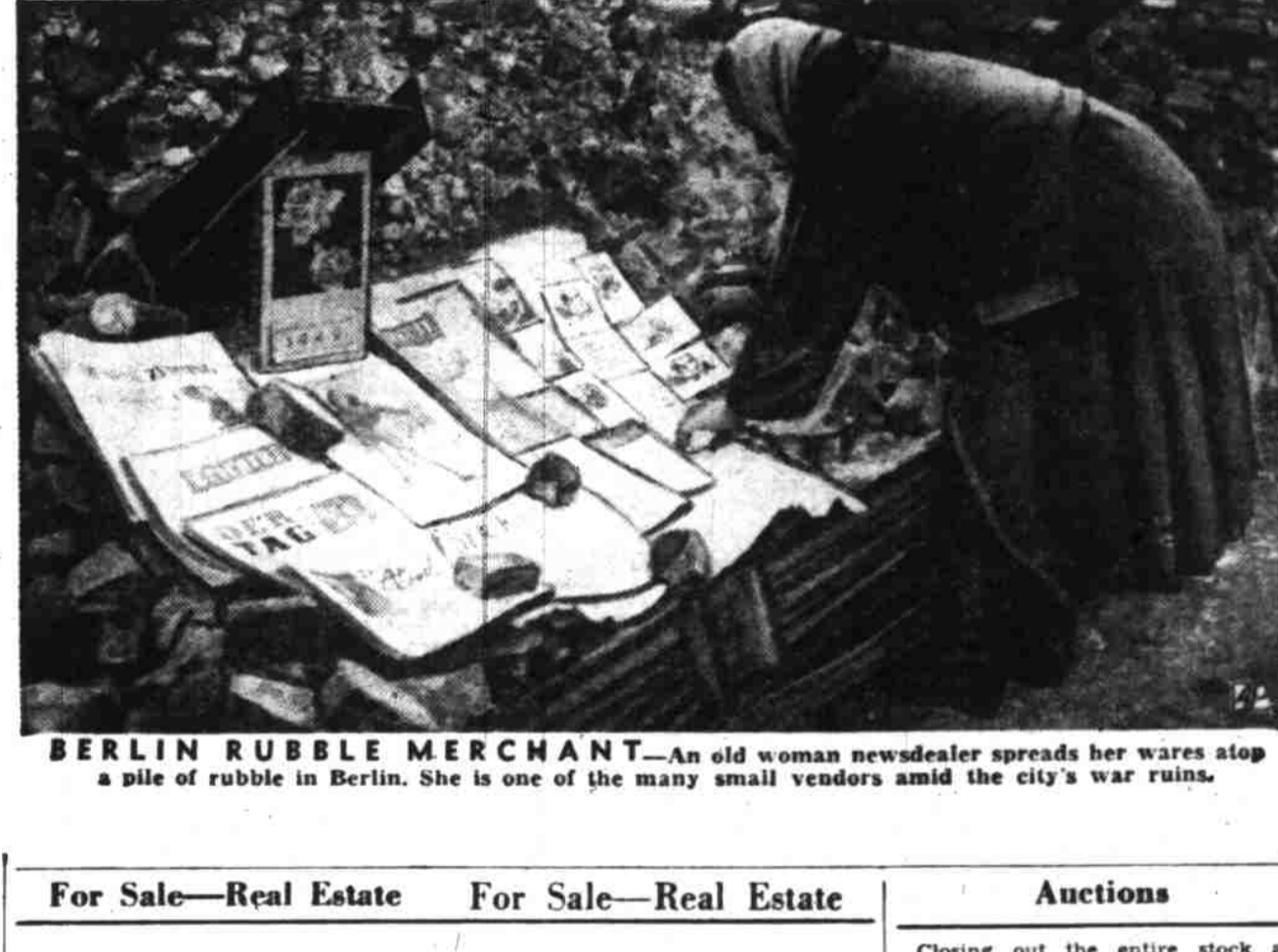
BERLIN RUBBLE MERCHANT —An old woman newsdealer spreads her wares atop a pile of rubble in Berlin. She is one of the many small vendors amid the city's war ruins.