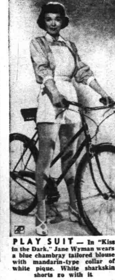
PLAY SUIT —In "Kiss in the Dark," Jane Wyman wears a blue chambray tailored blouse with mandarin-type collar of white pique. White sharkskin shorts go with it.