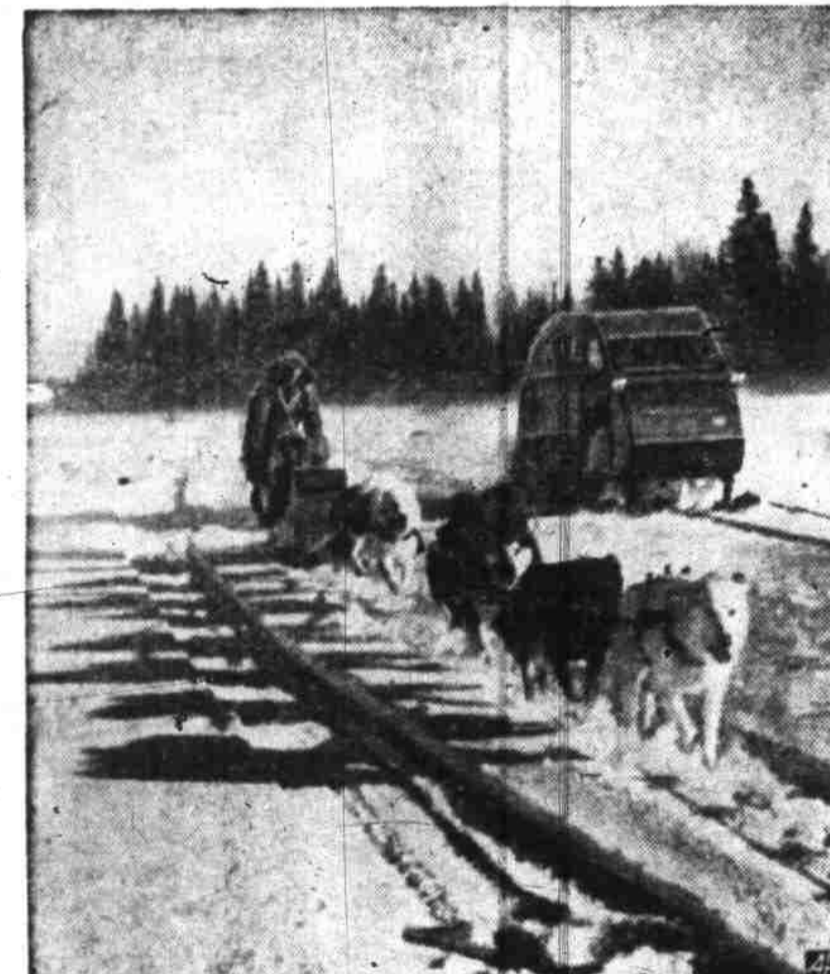
'BOMBARDIER' PASSES —"Bombardier," a snowmobile designed for the Arctic, passes a dog team. The auto-tractor makes Manitoba railhead and back in two days. Dogs take tea.