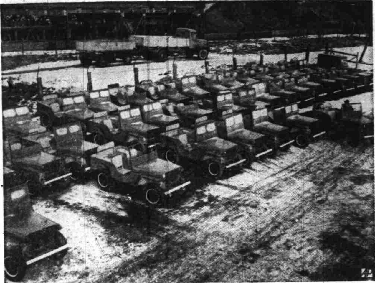
NEW JEEPS FROM OLD —For sale at 3,500 German marks per car are these jeeps turned out by a pair of automotive experts in Frankfurt, Germany. They purchased 1,300 "scrapped" jeeps from the Office of Military Government organization and from them built 800 "new" cars.