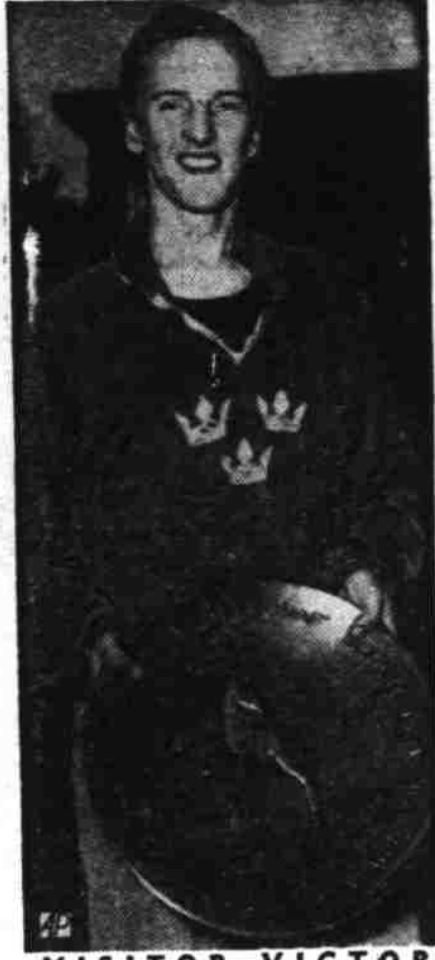
VISITOR-VICTOR —Lennart Strand, Swedish champion, holds the plate he won by beating Ludwig Warnemunde, German champion, in a 1,500-meter race in Berlin.