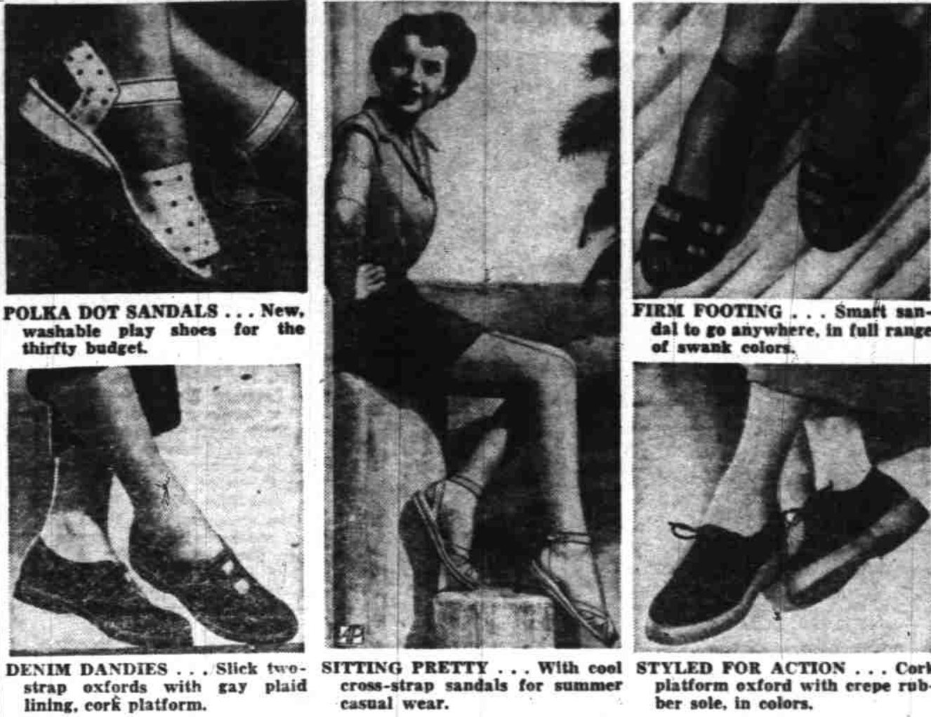
POLKA DOT SANDALS . . . New, washable play shoes for the thrifty budget.