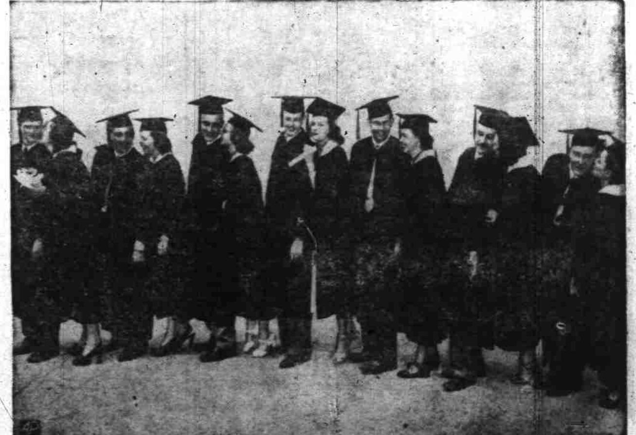
TWO DOCTORS IN EACH FAMILY —Seven husbands and wives, each of whom received a Doctor of Medicine degree, graduate together at the University of Illinois, Champaign.