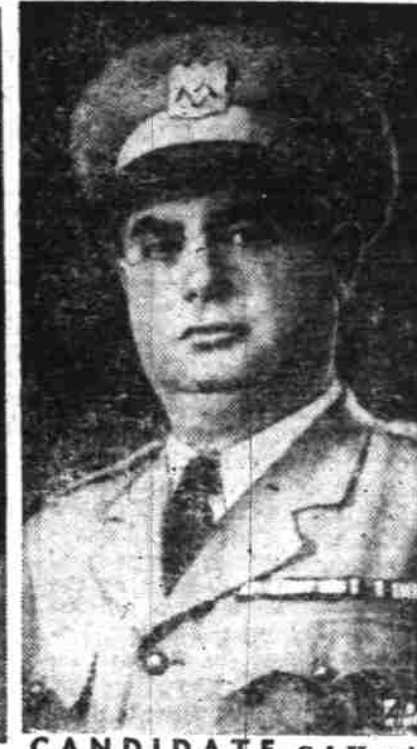
CANDIDATE —Col. Husni Zayim, Military Governor of Syria, is the only candidate for president in June 25 election.