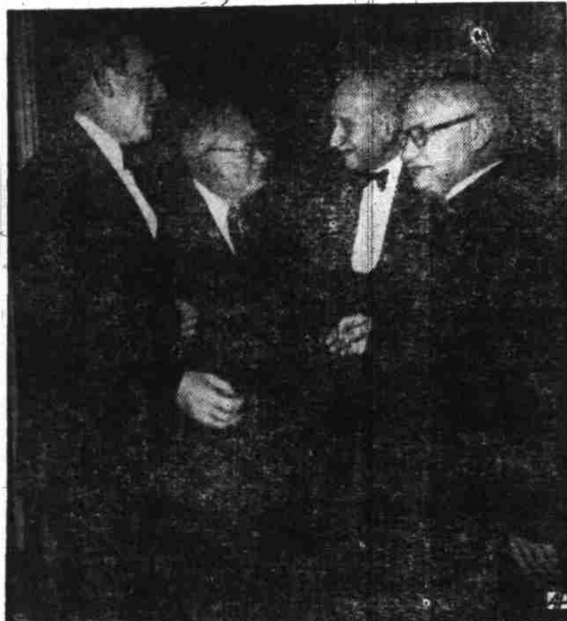
AWAY FROM COUNCIL TABLE —The Big Four Foreign Ministers, Dean Acheson, U. S.; Andrei Vishinsky, U. S. S. R.; Robert Schuman, France; and Ernest Bevin, Great Britain (l. to r.) attend dinner given by the French government.