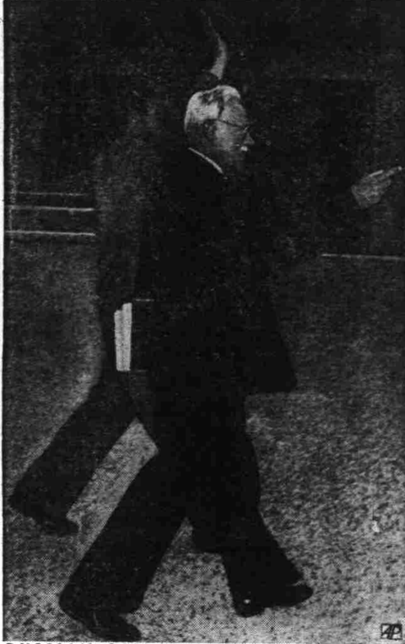
RUSSIAN CAR CALLS —Andrei Vishinsky, (foreground), Soviet Foreign Minister, and an aide differ in methods of calling Vishinsky's car after a Foreign Ministers' session in Paris.