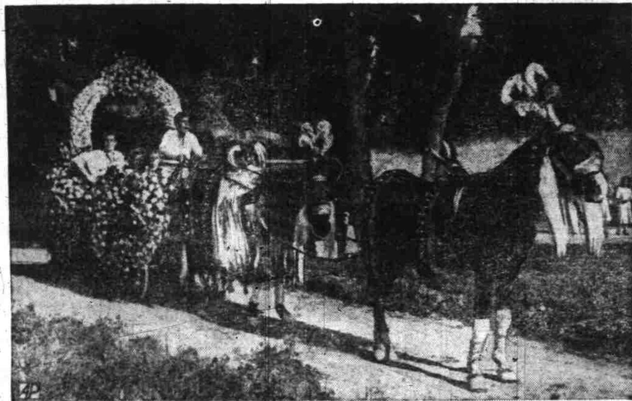
WINEMAKERS CHAMPION —This flower-covered winecart won first prize among grape growers near Albano, Italy, during the annual holiday in honor of Roman wine buyers.