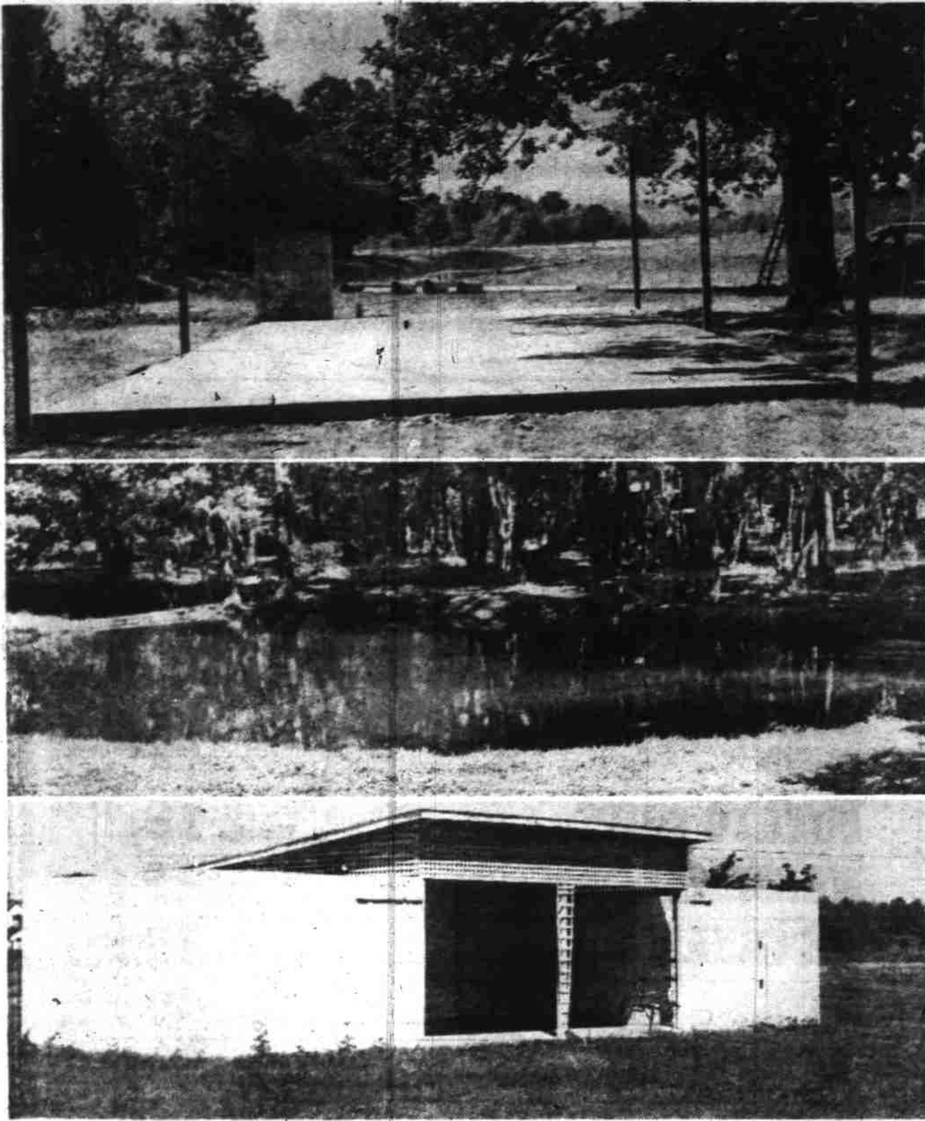
New facilities of Paradise Island picnic area include an outdoor dancing pavilion, top photo; new swimming pool, center; and new dressing rooms, bottom. More than $3,000 has been spent in improvements to the area this spring by new owners Mr. and Mrs. O. R. Nation.