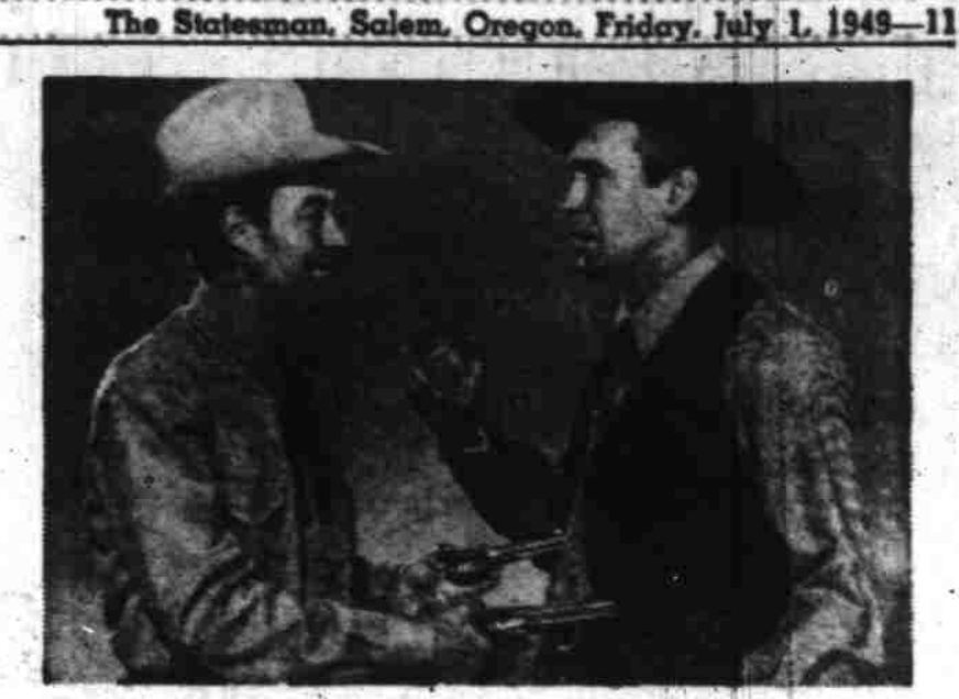
William Elliott holds up Forrest Tucker in this scene from Republic's "The Last Bandit," in Trucolor and now at the Grand with "Bomba the Jungle Boy."